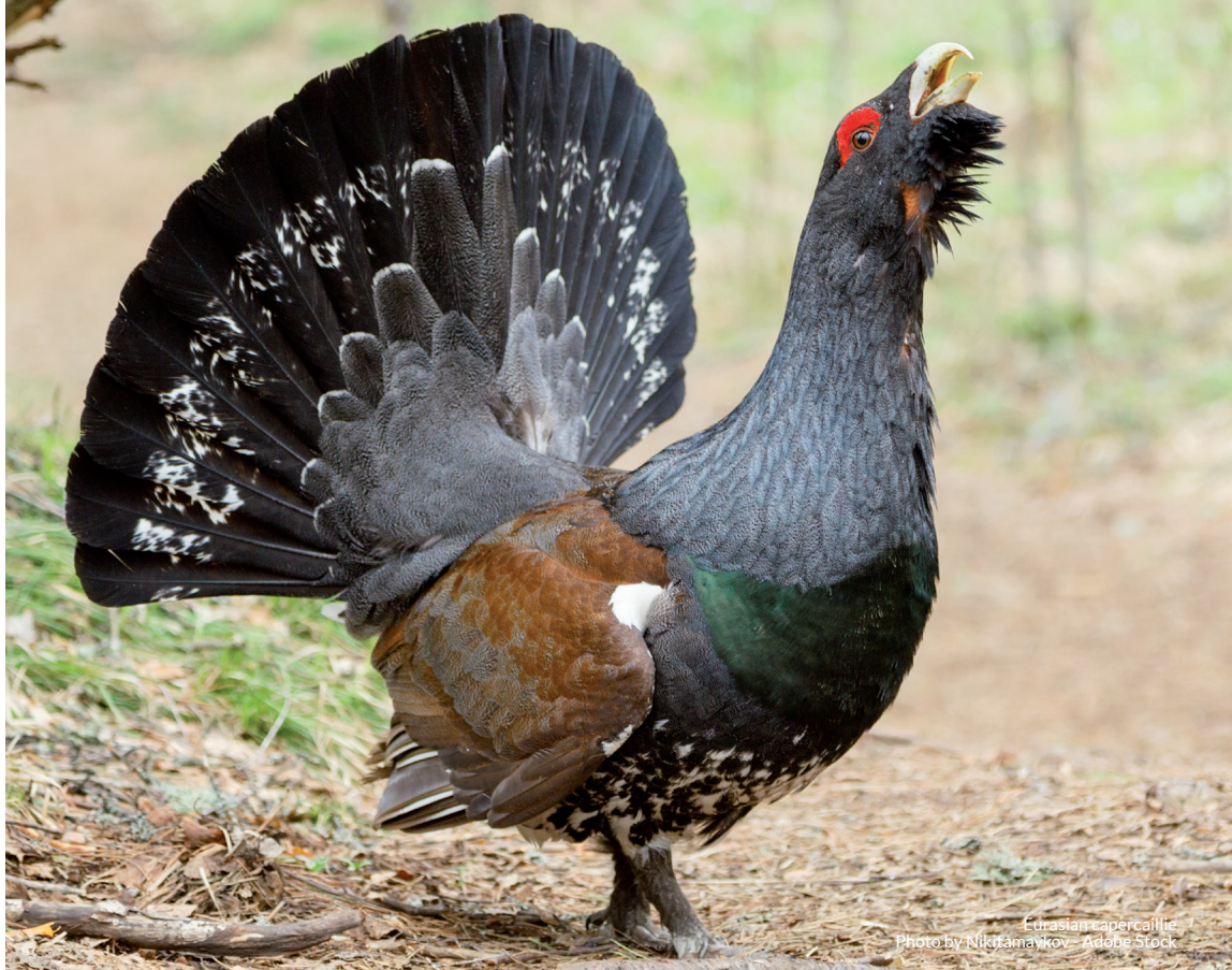
Eurasian capercaillie