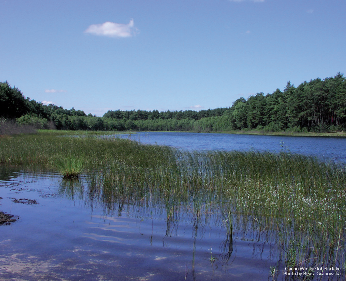
Gacno Wielkie lobelia lake