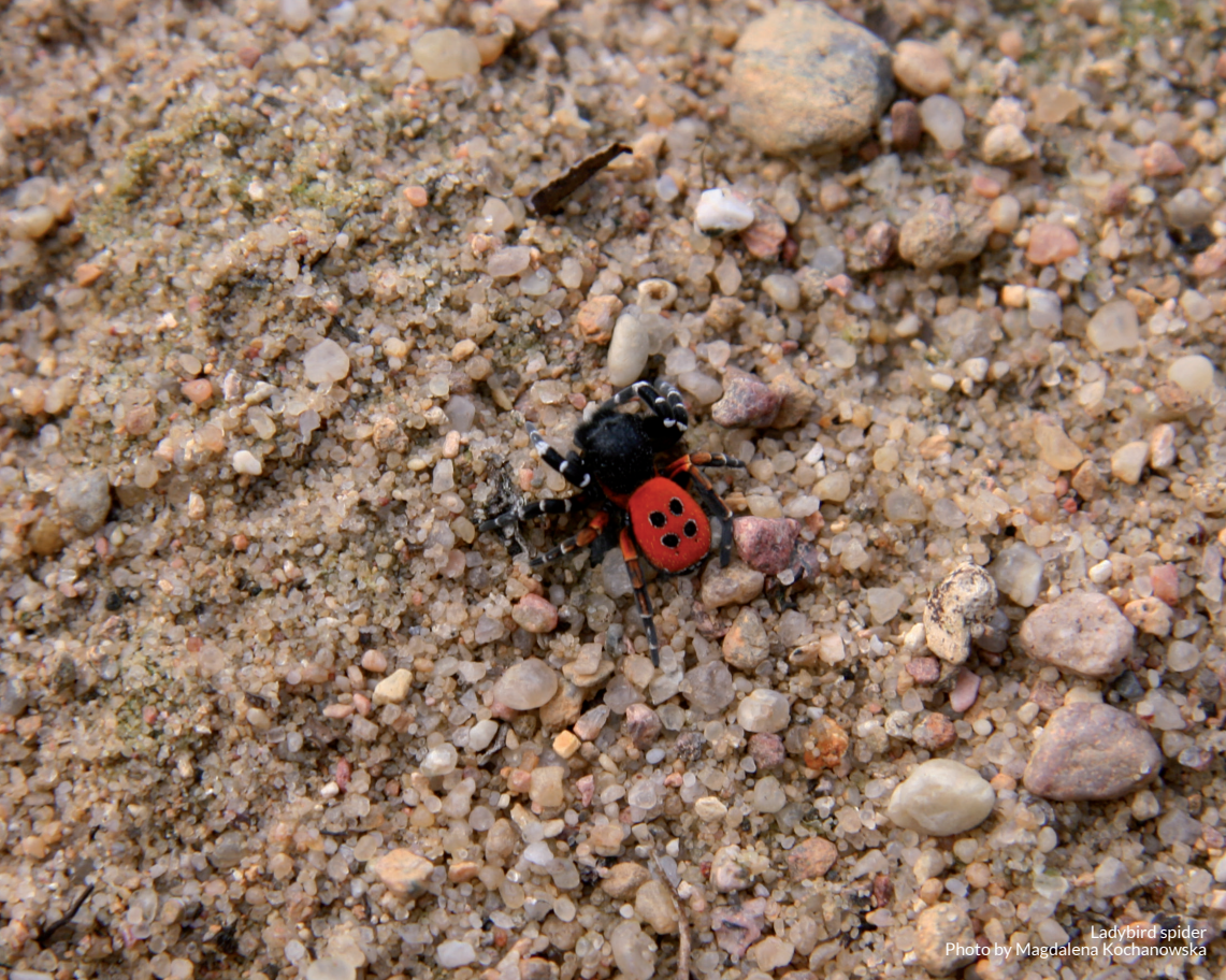
Ladybird spider