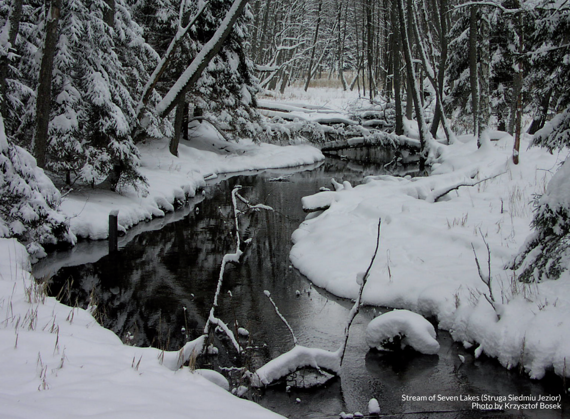
Stream of Seven Lakes (Struga Siedmiu Jezior)