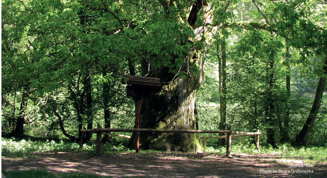
„Bartus” oak