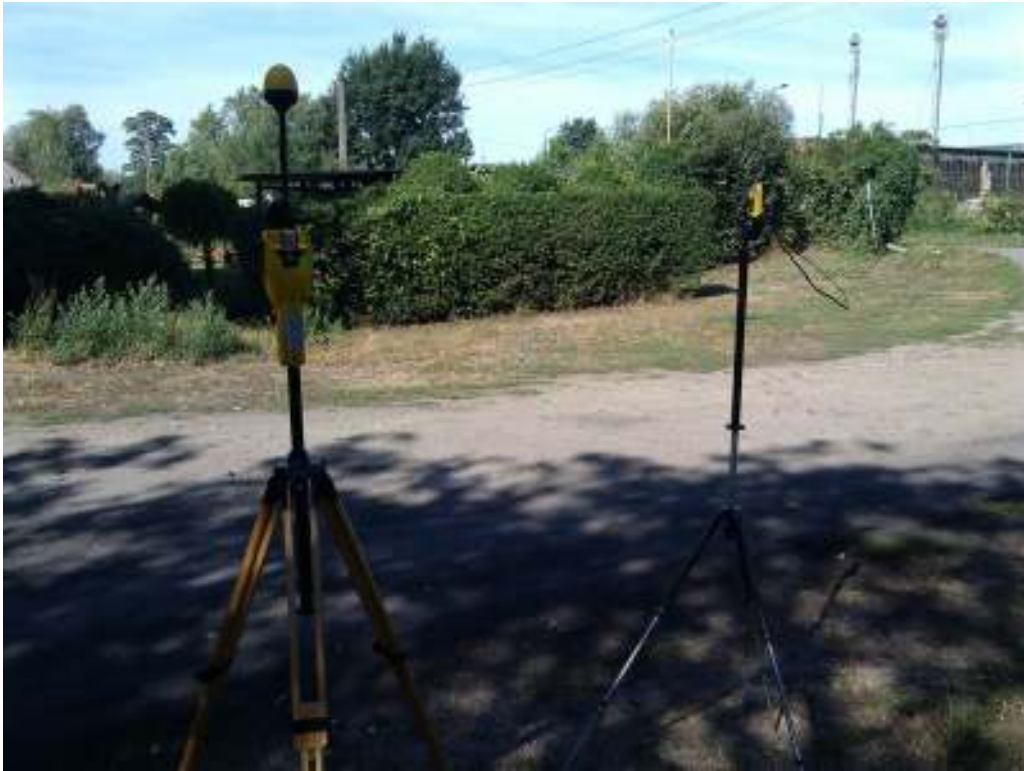
Fot. 3. Rejon badań, widok w kierunku zachodnim