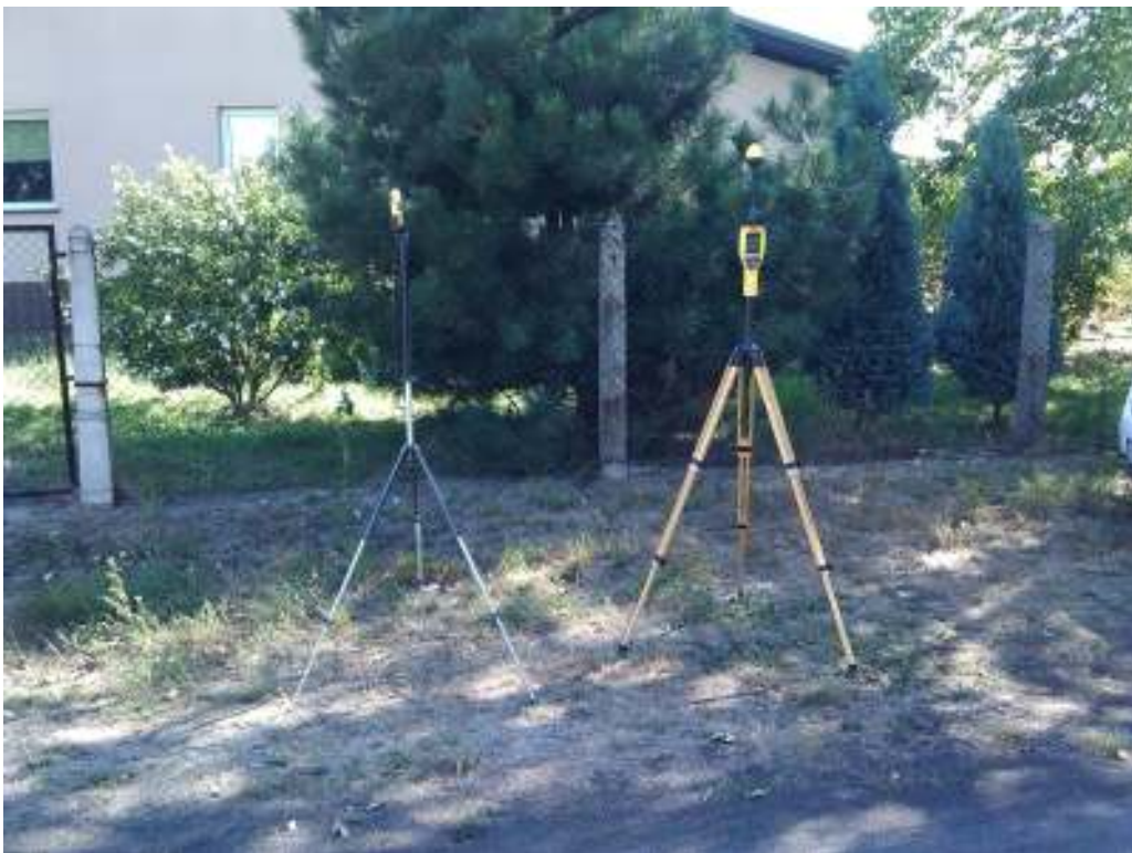
Fot. 2. Rejon badań, widok w kierunku wschodnim