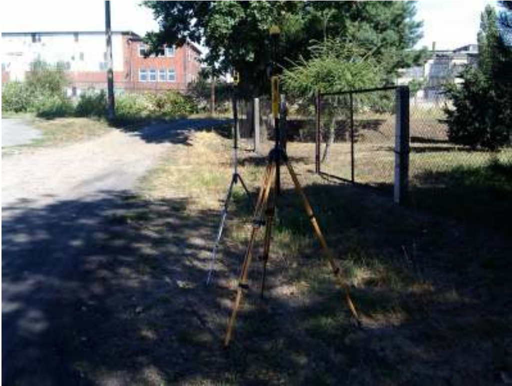
Fot. 1. Rejon badań, widok w kierunku północnym