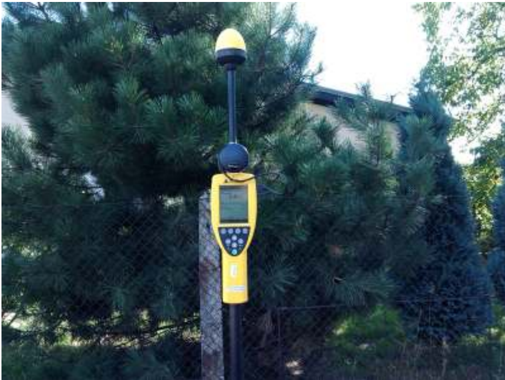
Fot. 4. Urządzenie pomiarowe w trakcie prowadzonego badania