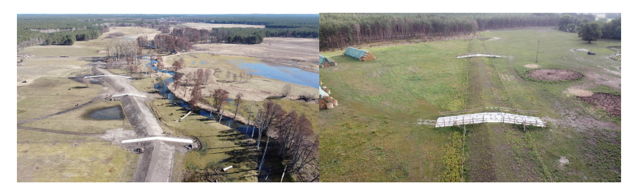
Photo 1 and 2: Sample photographs of crossings taken at the request of property owners

The implementation of the task also resulted in permanent property restrictions. These actions were taken at the request of property owners, submitted during the execution works. It was agreed that property owners would voluntarily consent to the permanent restriction of their properties in exchange for the reconstruction of the crossings. Therefore, the crossings and passages were redesigned and built in accordance with the owners' expectations. Thanks to this solution, more useful communication solutions were created. The aim of the permanent property restriction was to improve the usability of the crossings and passages. The Investor's actions in this area are an example of good cooperation with local residents and the implementation of the project taking into account the justified interests of PAP.