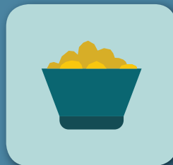
ARTISANAL AND SMALL-SCALE MINERS