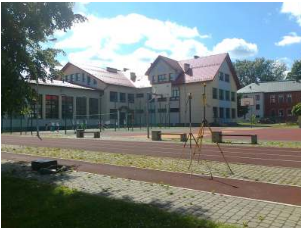
Fot. 2. Rejon badań, widok w kierunku południowo-wschodnim