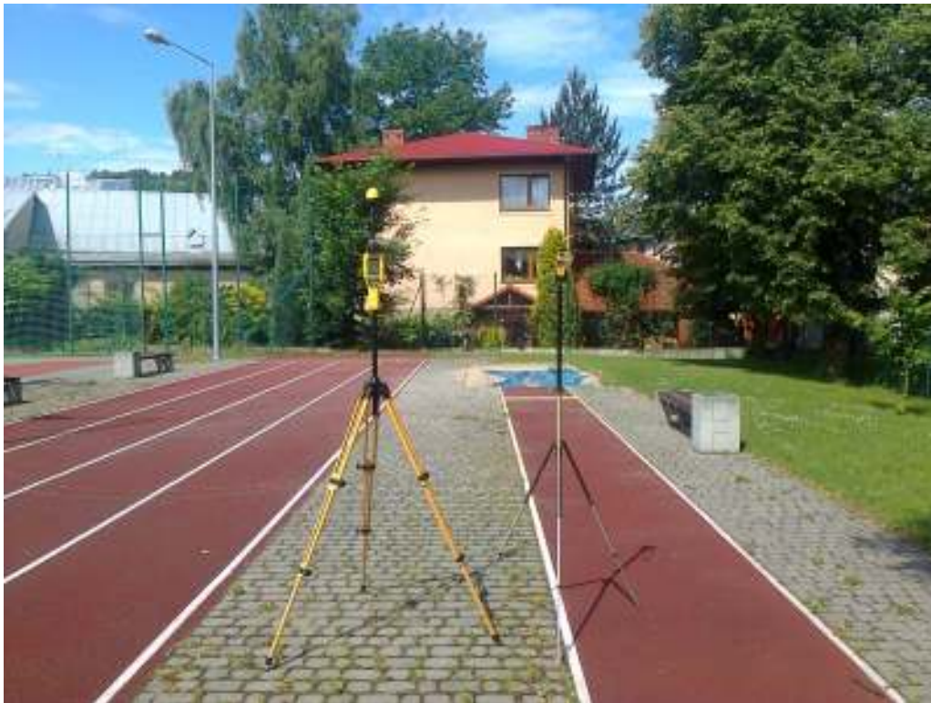
Fot. 1. Rejon badań, widok w kierunku zachodnim