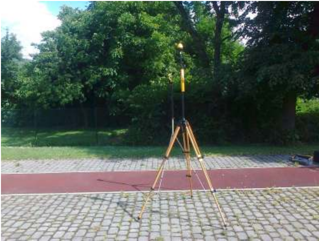
Fot. 3. Rejon badań, widok w kierunku północnym