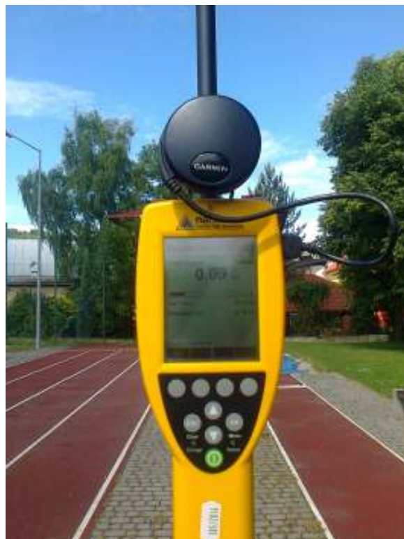
Fot. 4. Urządzenie pomiarowe w trakcie prowadzonego badania