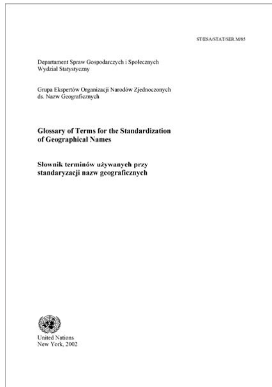
Fig. 2. The cover of the 2014 Polish edition of “Glossary”.

In 2002, during the Eight United Nations Conference on the Standardization of Geographical Names, the next version (under the title of “Glossary of terms for the standardization of geographical names”) was presented, edited by Naftali Kadmon 3 . The work consists of six parts, each of which with entries in a different language version: English, French, Spanish, Russian, Chinese and Arabic (i.e. official languages of the United Nations). The English version and the numbering used therein is considered primary, so the remaining