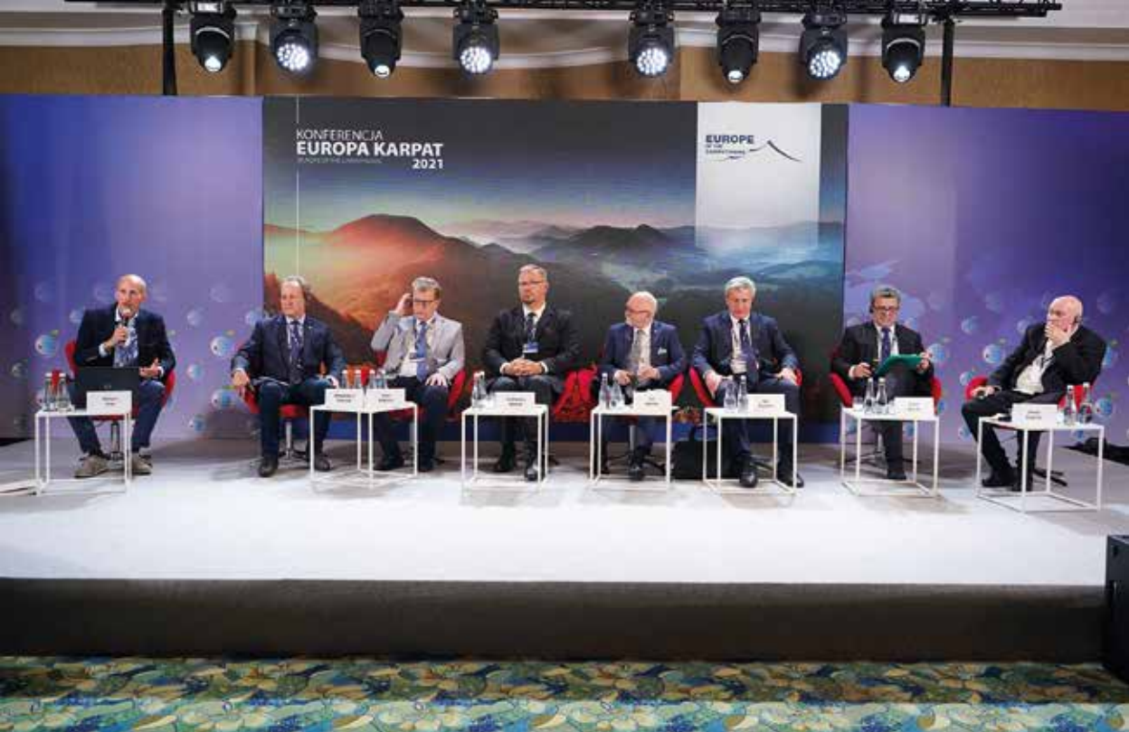
Participants of the panel Central Europe – heritage, people and future , Karpacz, 9 September 2021

The Ambassador added that a new master's degree course had been opened at Lviv University – regional Baltic-Black Sea studies.