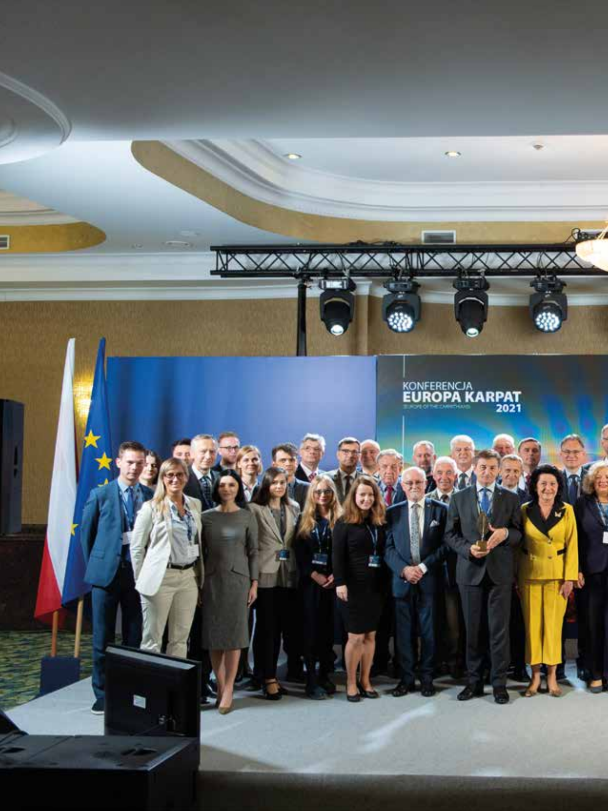
Participants of the 30 th "Europe of the Carpathians" Conference in Karpacz, 7 September 2021