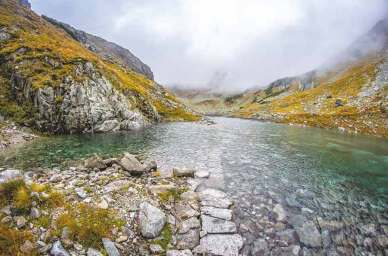
The Za Mnichem Valley, the Tatra Mountains, Polska

Digitisation is one topic of genuine common interest, considerable synergies, and untapped opportunities. The Central and Eastern Europe countries are making a developmental leap in this area by building infrastructure unencumbered by legacy systems. As there are not always technological giants there, they are open to developing with the most modern global solutions, without jealousy of other countries' leading roles and without the ambition that their local proposals are the ones to provide universal solutions. They may be interested in a more liberal and free-market approach to regulating digital services. The think-tank Atlantic Council recently set up a task force of local experts that made many recommendations in a paper entitled "Digitisation in Central and Eastern Europe: Building Regional Cooperation". Recommendations include setting aside funds from the EU Reconstruction Fund to initiate regional coordination in this area, setting up a roundtable of ministers from relevant ministries, infrastructure cooperation, support for startups, education, etc. Digital cooperation can serve as an example for many other policy areas.