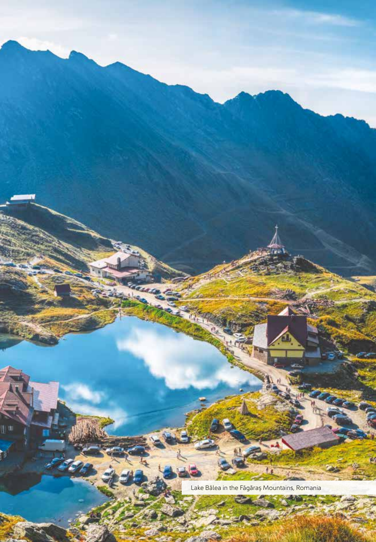
Lake Bălea in the Făgăraș Mountains, Romania