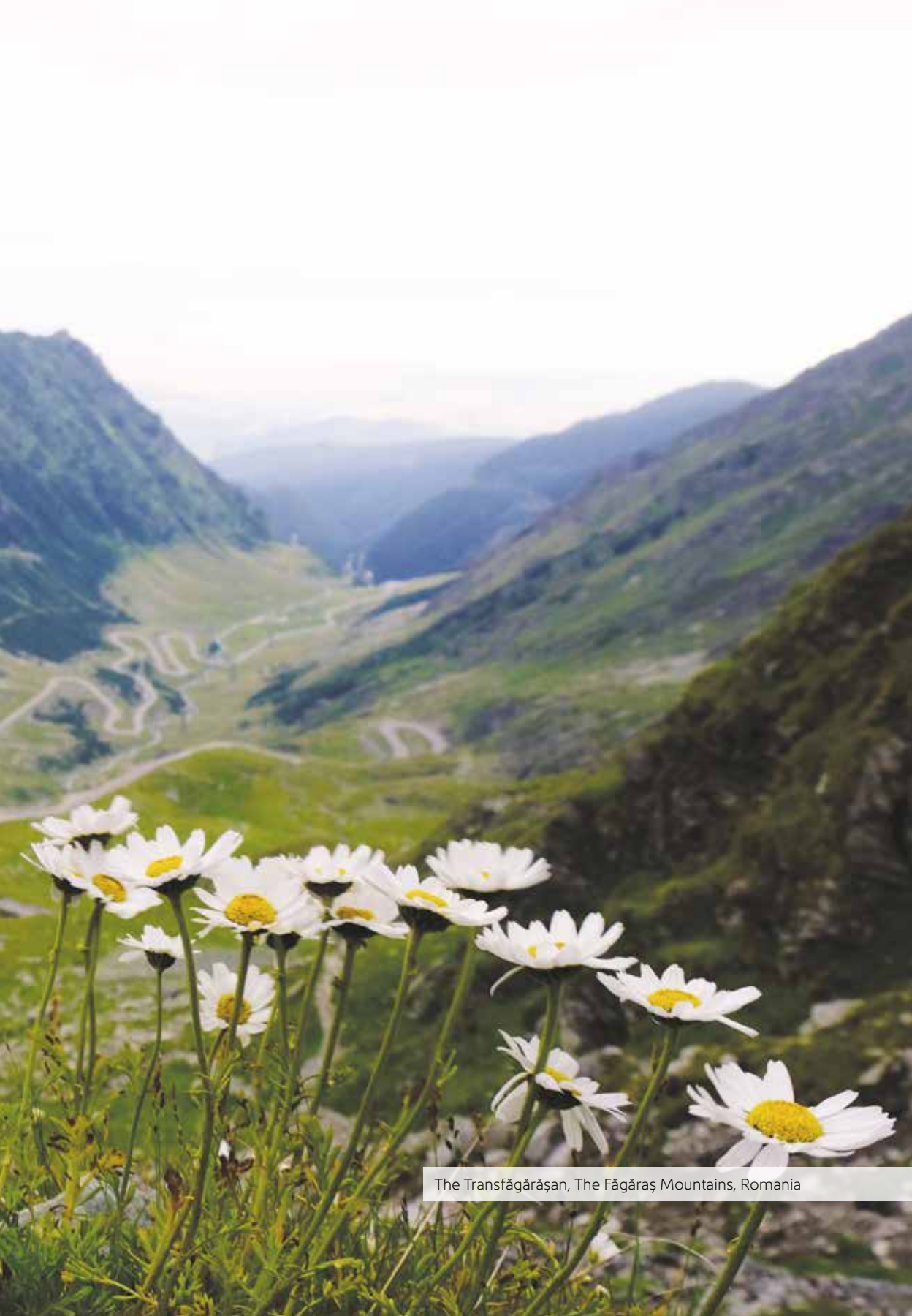
The Transfăgărășan, The Făgăraș Mountains, Romania