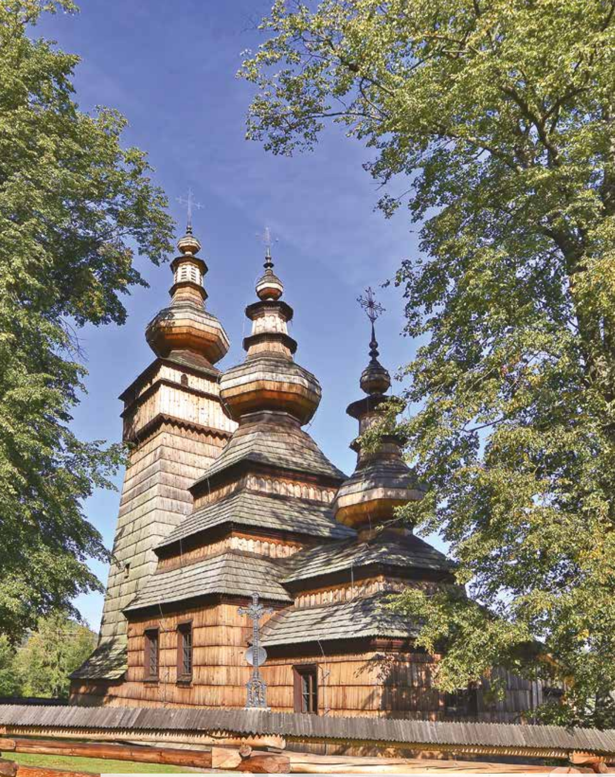
The former Greek Catholic church (now Roman Catholic church) in Kwiatów – an object on the Wooden Architecture Route in Małopolska, Poland