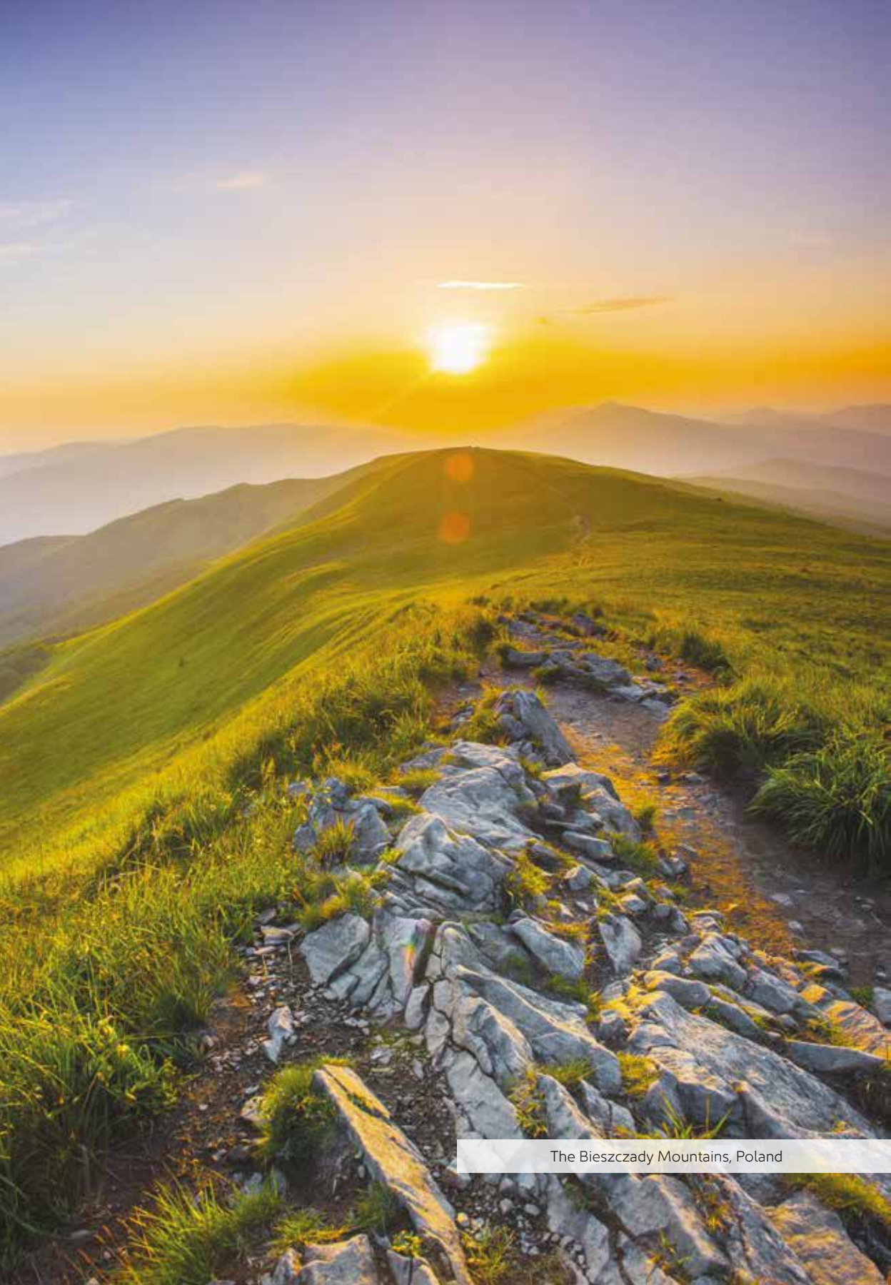
The Bieszczady Mountains, Poland