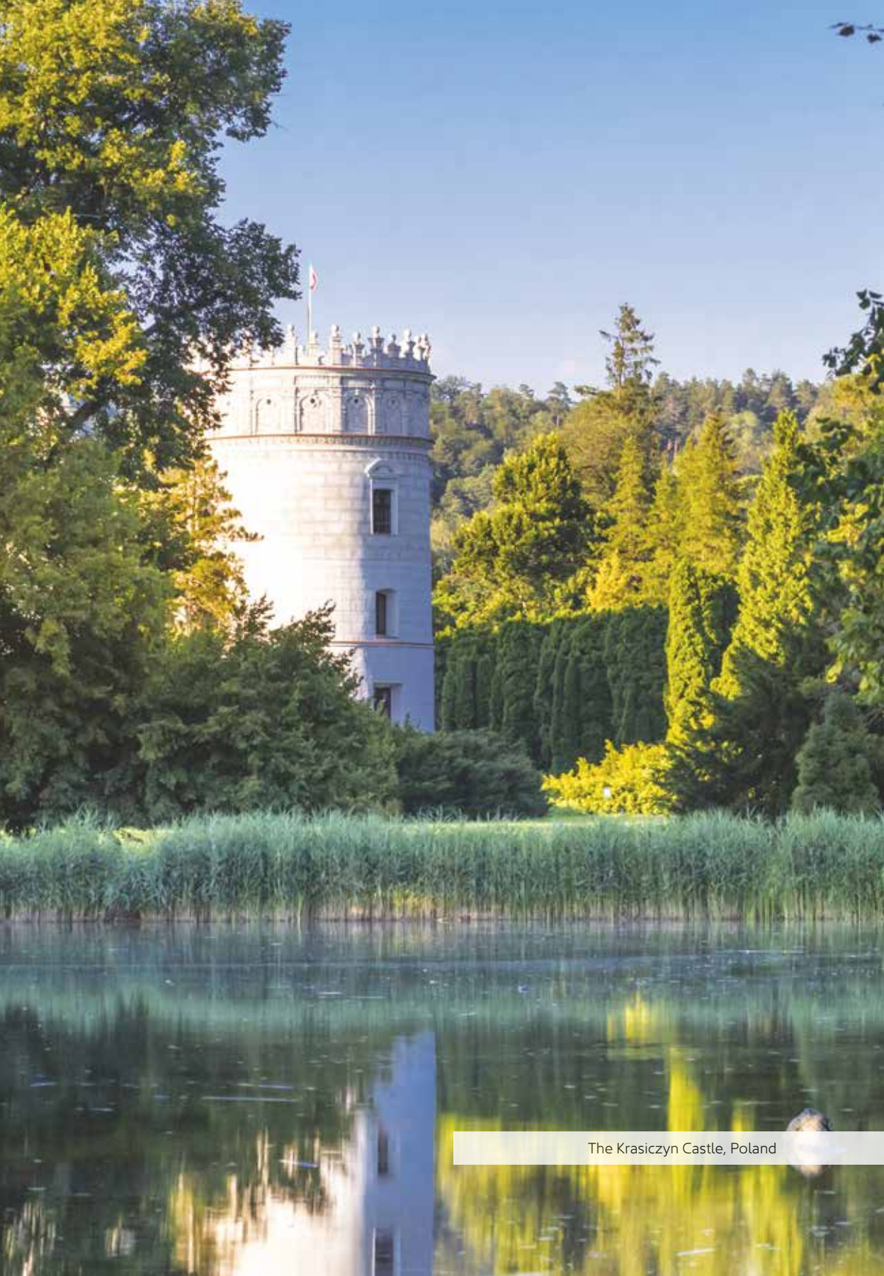
The Krasiczyn Castle, Poland