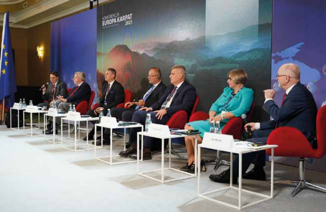
Participants of the panel Future Europe – open or closed , Karpacz, 8 September 2021.

In his opinion, most Georgians believe that Europe should remain open. He stressed that he would like even Euro-sceptics to look optimistically at the future of the European Union. He expressed concern over Russia's action and hoped that European countries would not forget about countries like Georgia, which had been in Europe for centuries.