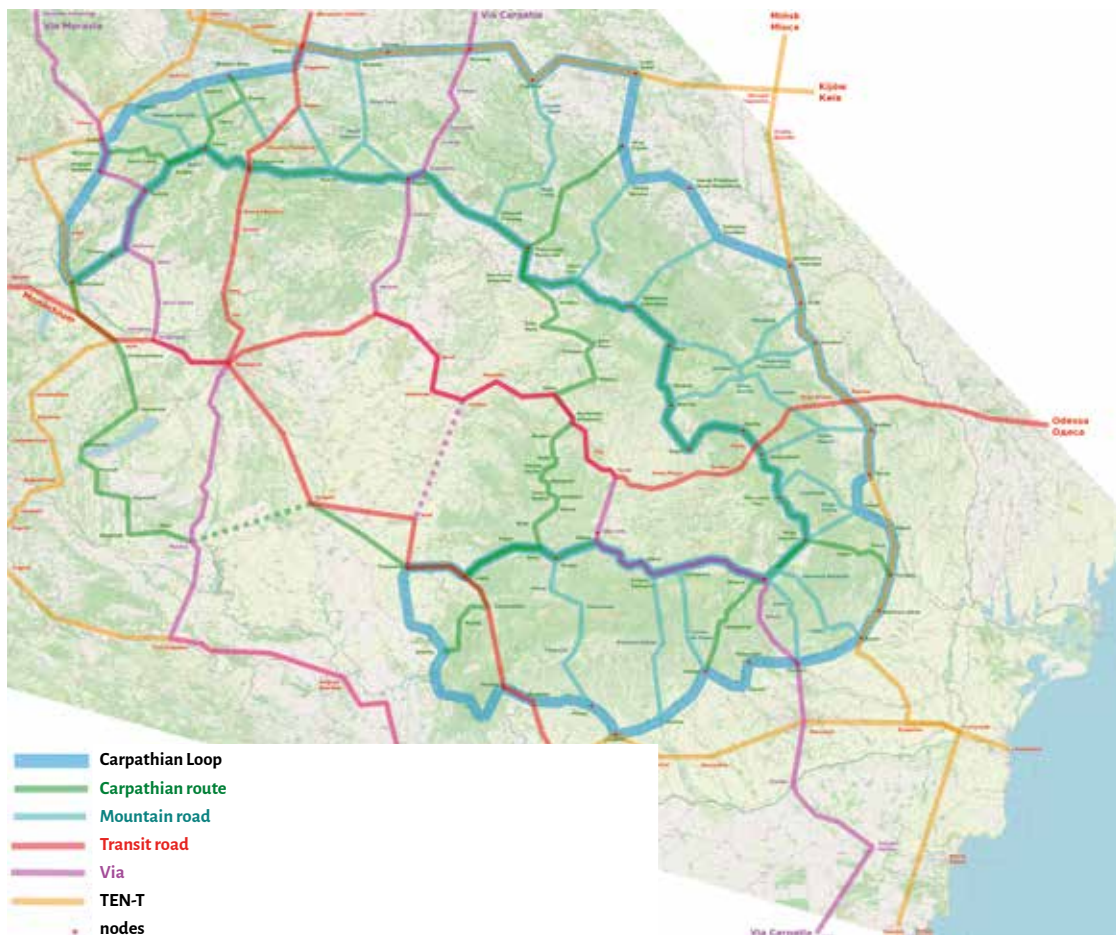
Fig. 2. Spatial model.

uses parts of the Carpathian routes: the TBT (from Timișoara to Brasov), the TSMT (reversed route from Brasov – via Mukachevo – to Žilina) and the TWS (reversed route from Žilina to Bratislava).