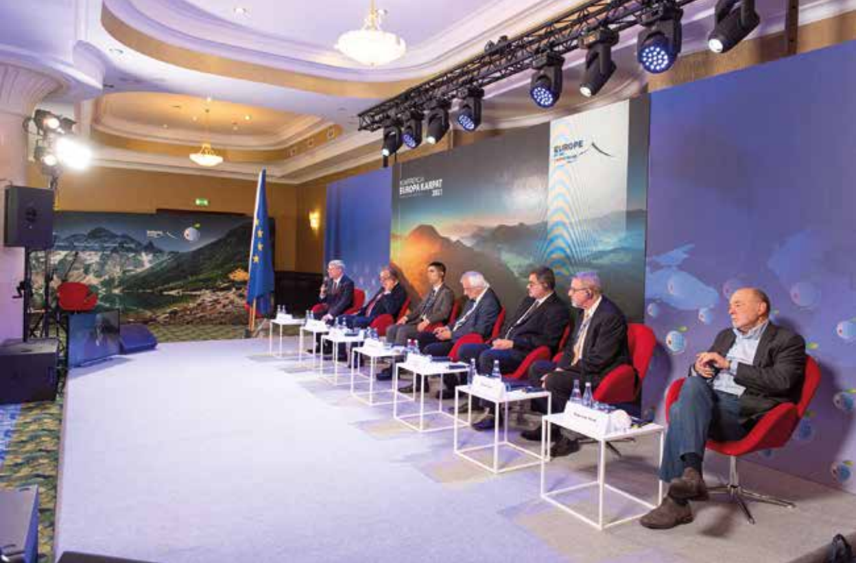
Participants of the panel 30 years of free Central European states and building regional cooperation , Karpacz, 8 September 2021