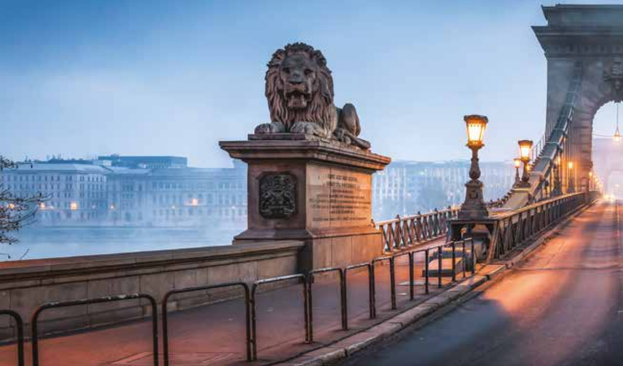
The Széchenyi Chain Bridge in Budapest, Hungary

emphasise the hope that, very often, such a crisis becomes a powerful instrument of development. The fundamental issue today is the deep penetration of international law into all spheres of international life, where it has taken the lead as the warp of the modern international system.