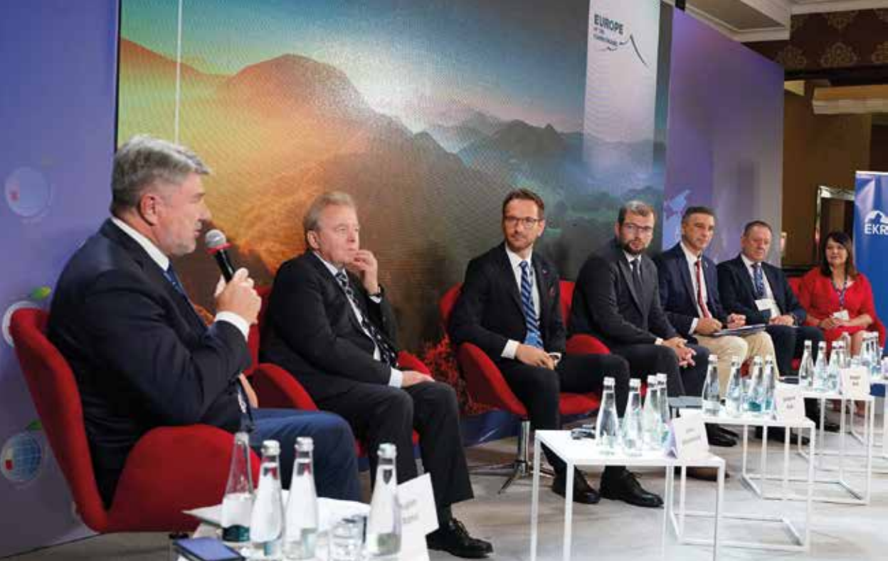
Participants of the panel Presentation of the Green Deal for Central Europe , Karpacz, 9 September 2021

on the system of small and medium family farms – and regain what was lost in a few years or so.