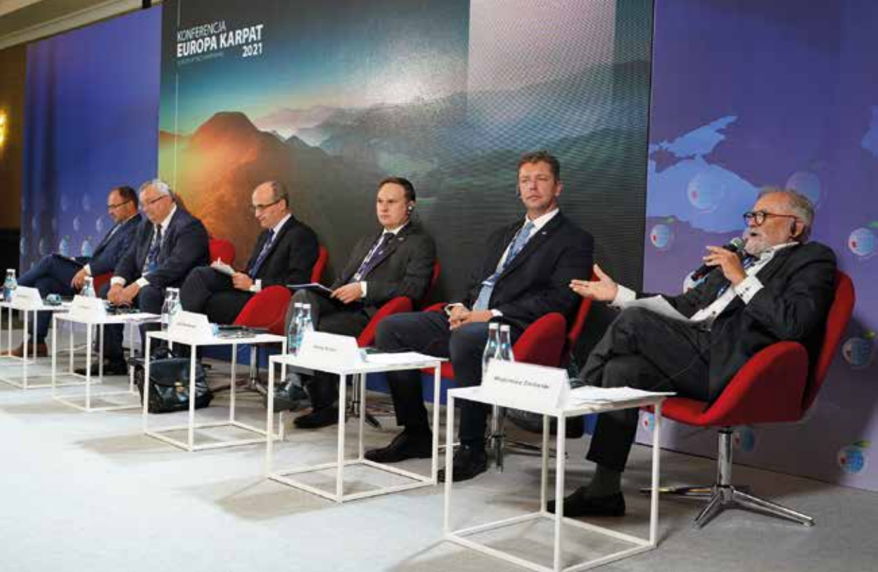
Participants of the panel The impact of the Green Deal on transport policy in Central Europe , Karpacz, 8 September 2021

Warsaw were being built was to be implemented in the Baltic States. The Deputy Minister expressed satisfaction that such a project was also being implemented in the Visegrad Group countries – Slovakia, Poland, the Czech Republic and Hungary. He said that Via Baltica would be completed in 2026. He added that road infrastructure was currently carried out the most freight transport in the region, which was unacceptable. Moreover, Deputy Minister Skačkauskas pointed out that rail infrastructure was costly, and if it was not used, it became economically unviable.