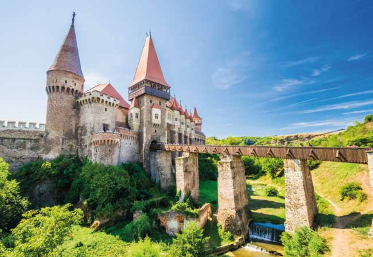
The Corvin Castle, Hunedoara, Romania