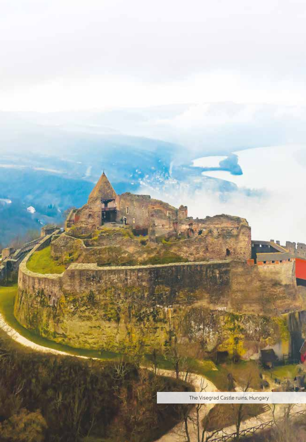
The Visegrad Castle ruins, Hungary