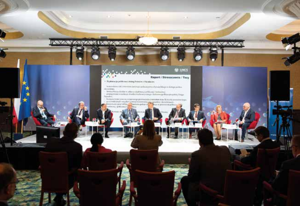
Participants of the panel The state and perspectives of partnership between Poland and Ukraine , Karpacz, 9 September 2021

Such areas in Polish-Ukrainian relations could include the following sectors: fuel and energy, the arms industry, infrastructure and transport, and IT. So it is in these areas that what we call the materialisation of a strategic partnership between Poland and Ukraine could be made.