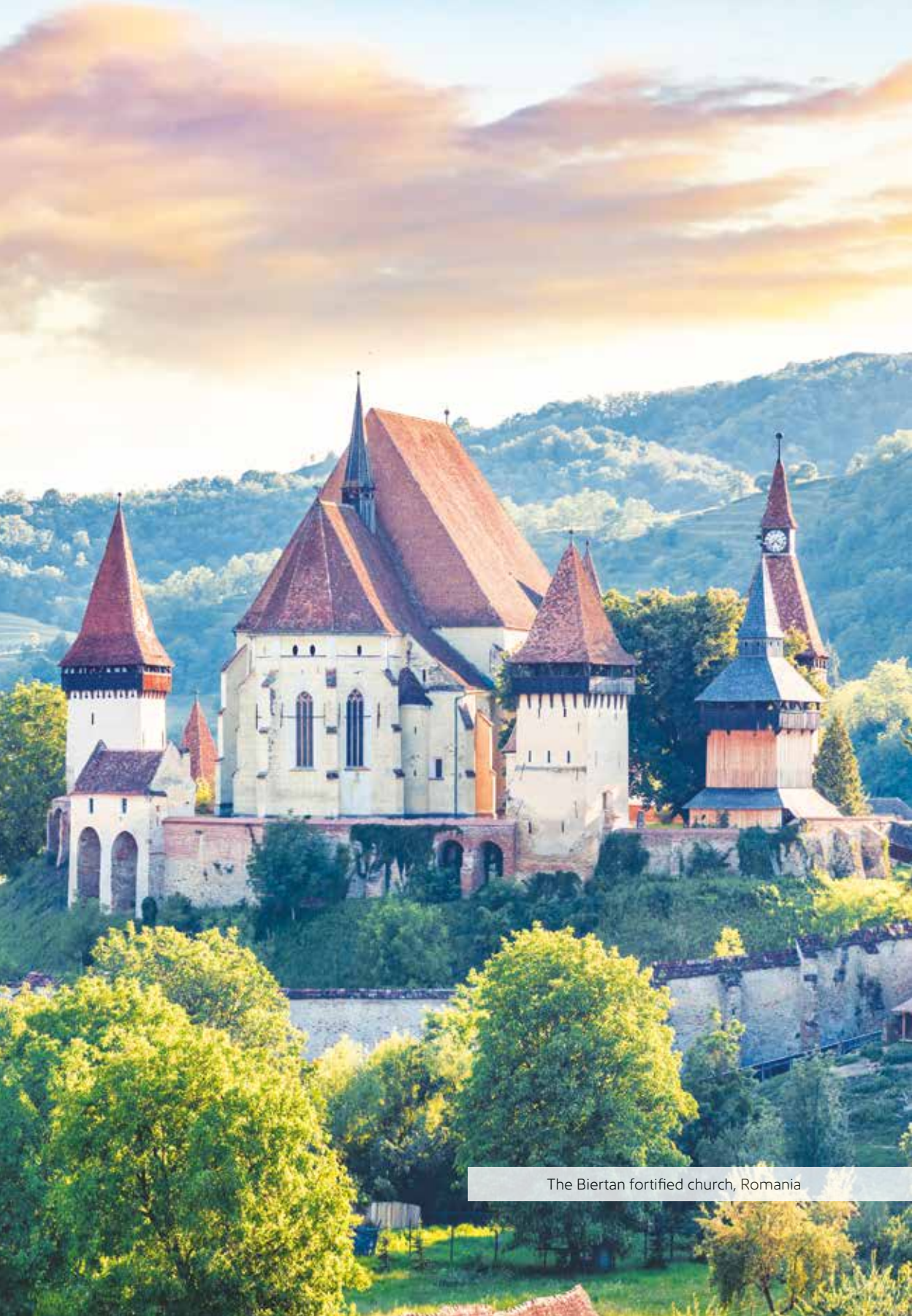
The Biertan fortified church, Romania