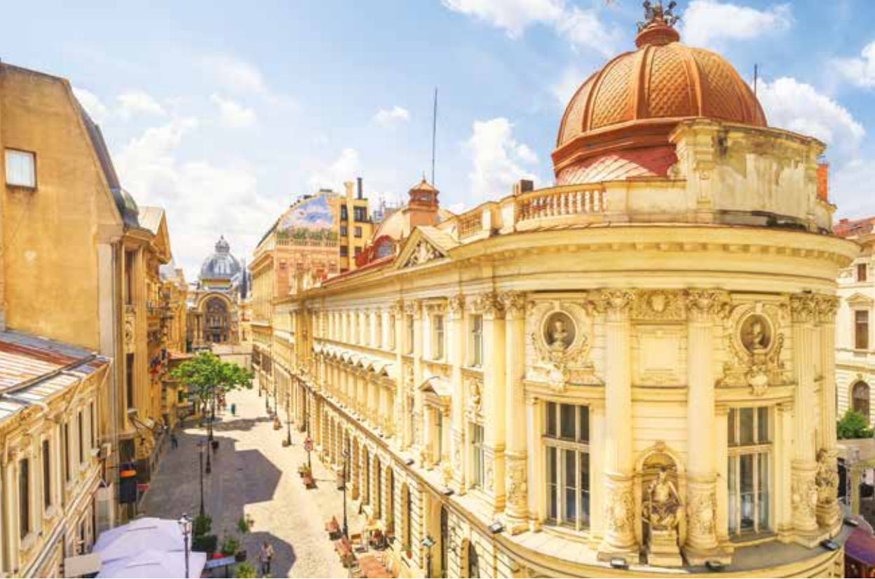
The Old Town in Bucharest, Romania

We are pleased that representatives of various sectors and levels of governance have expressed similar interests. I hope that that gives us a reasonable basis for preparing joint pilot projects and implementing them.