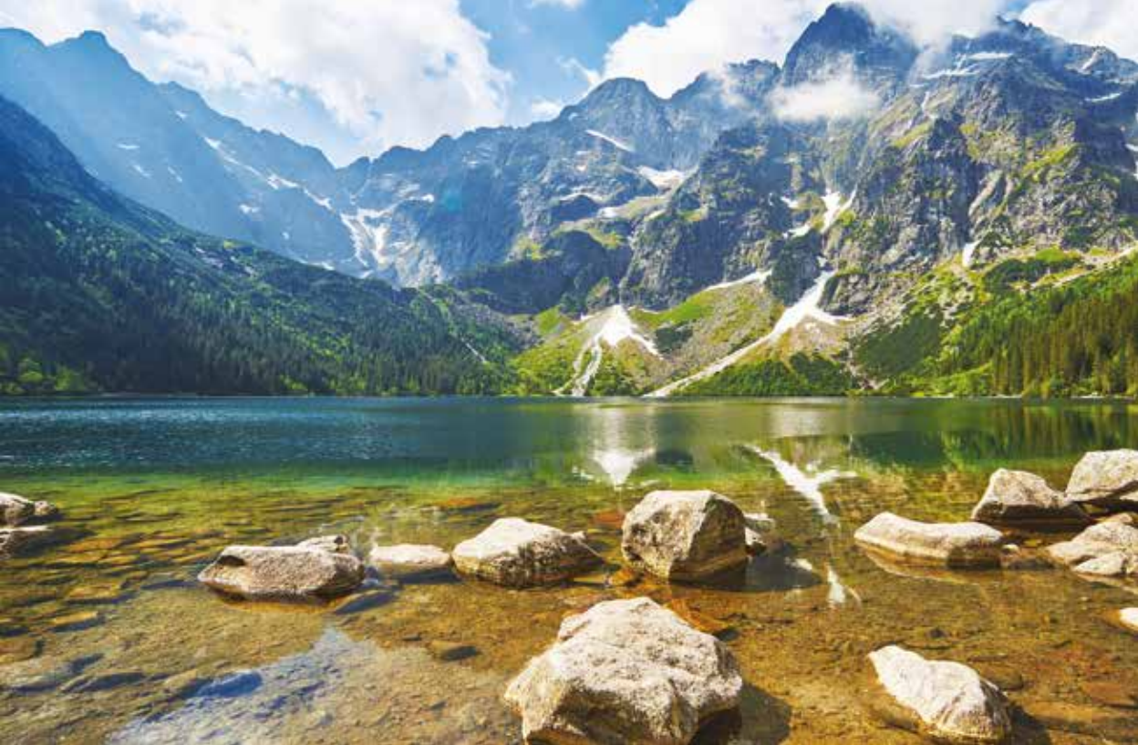
Lake Morskie Oko, the Tatra Mountains, Poland

Although it undoubtedly constitutes only a trace of the discussions held and works done, this publication is significant. Nothing can replace personal participation in the Conference “Europe of the Carpathians”, which was also proved by the very high attendance of the public at the 30 th edition in Karpacz.