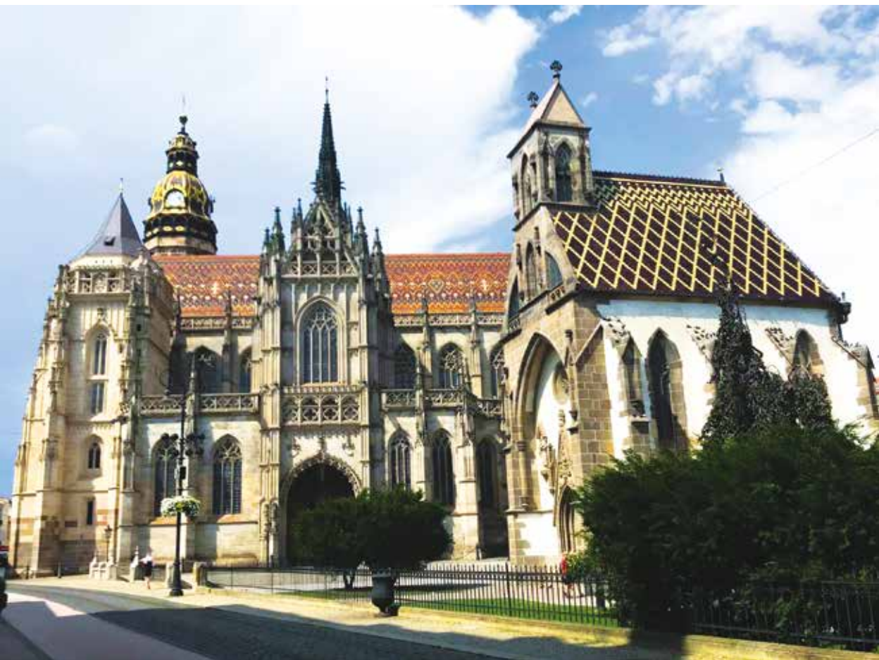
St. Elisabeth Cathedral in Košice, Slovakia

The trend in Europe and the world is that people are already reaching for good quality food, of the best quality. And we, Poland, have an outstanding brand in Europe.