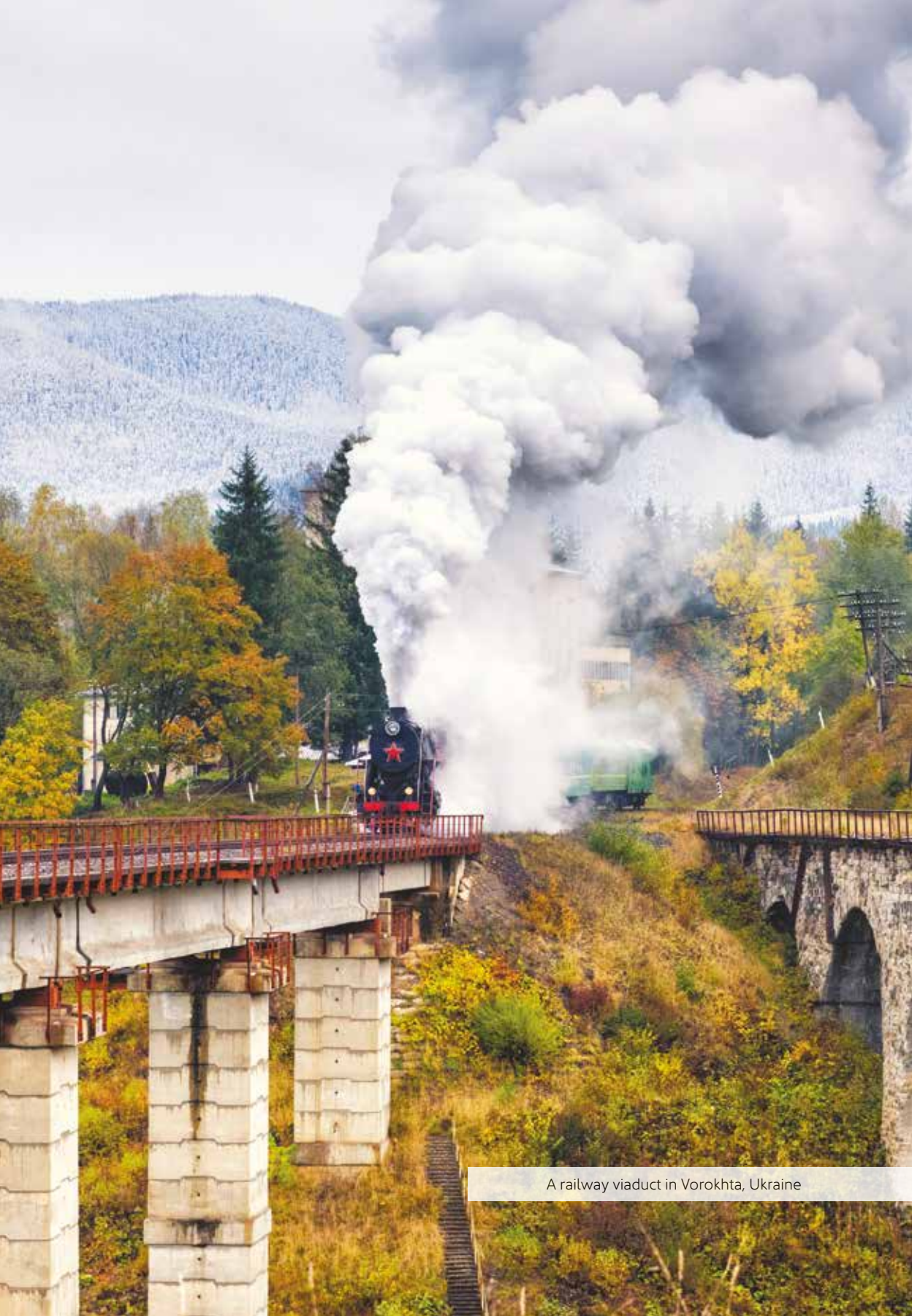
A railway viaduct in Vorokhta, Ukraine