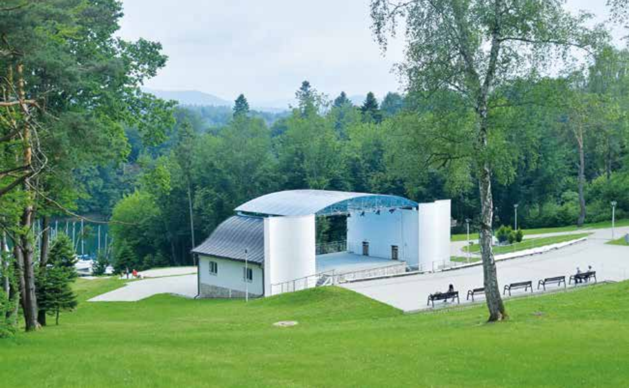
Zdrojowa Street, Polańczyk, Poland