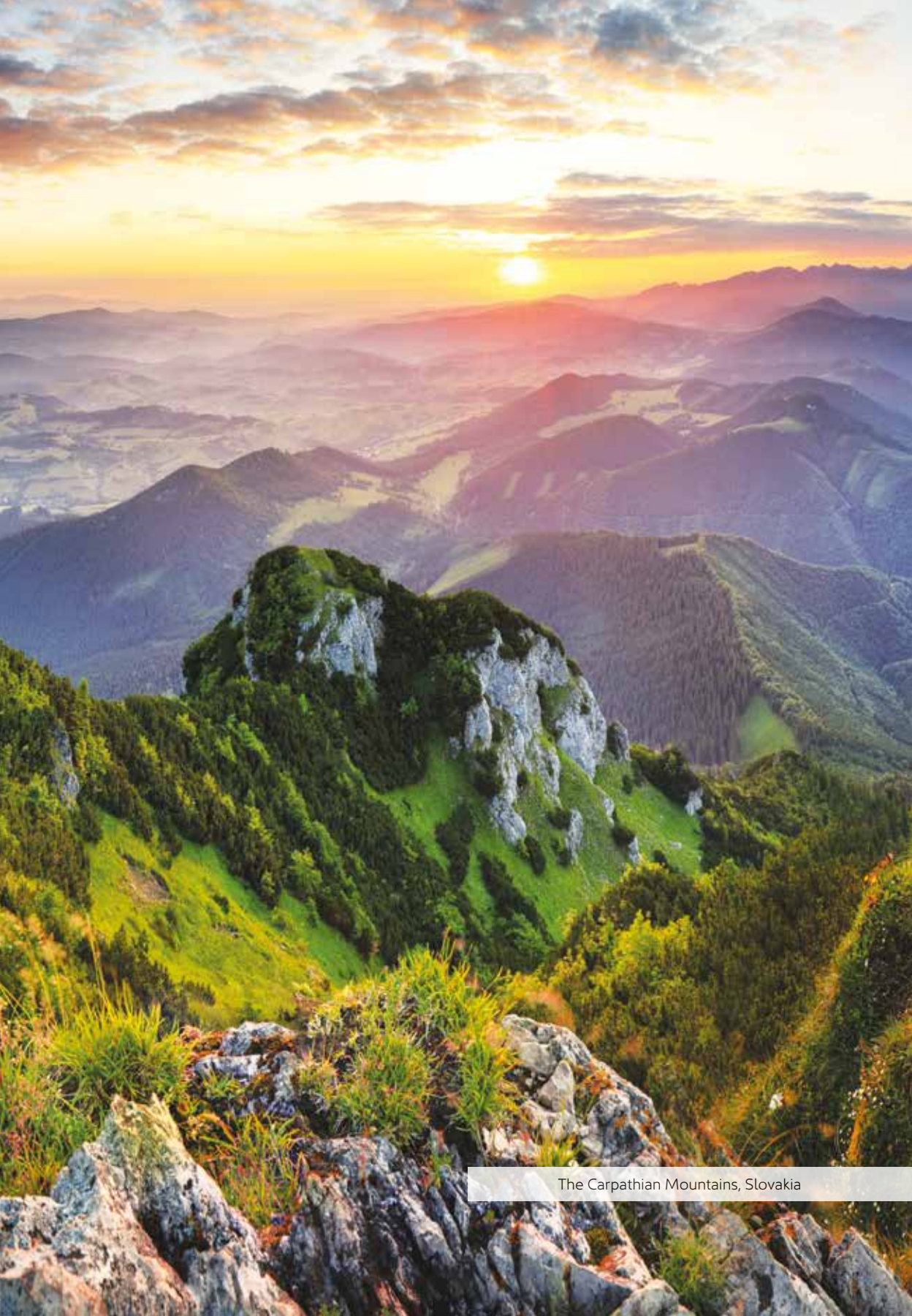
The Carpathian Mountains, Slovakia