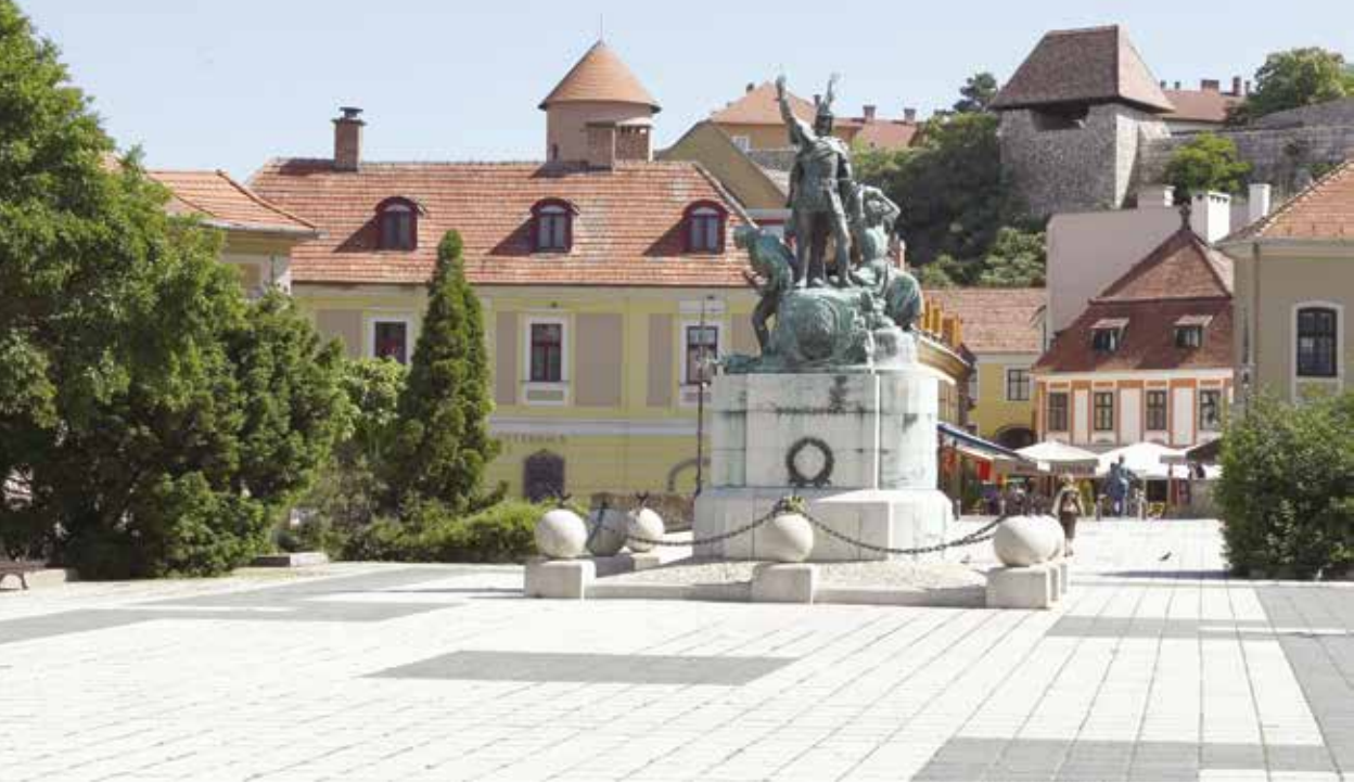
The Memorial to István Dobó – Defender of the Eger Castle, Hungary

and numerous hot conflicts is possible only through active diplomacy. At this point, it is essential to mention the very timely call by Ambassador Wolfgang Ischinger, the Head of the Panel of Eminent Persons on European Security, as a joint project “Back to Diplomacy”, to return “to diplomacy; a robust diplomatic process aimed at replacing mutual recriminations with the restoration of trust: not by military action, not by propaganda, not by rhetoric – but by a process that examines our common problems in a careful, confidential and systematic way.” 8