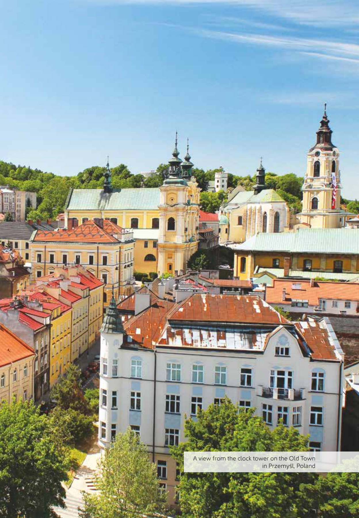
A view from the clock tower on the Old Town in Przemyśl, Poland