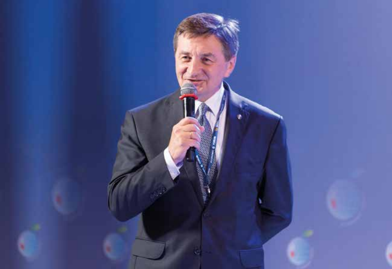
Marek Kuchciński – Chairman of the Foreign Affairs Committee of the Polish Sejm