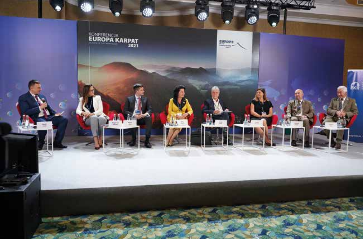
Participants of the panel New climate policy in the Carpathians – how to effectively protect the natural heritage in the Carpathians. Potential of national parks , Karpacz, 9 September 2021

There is a requirement to have forests in which we do not interfere – yes, I will agree with that – but it is necessary to conduct activities, forest management in a way that is compatible with the requirements of nature and with the interests of the local population and foresters.