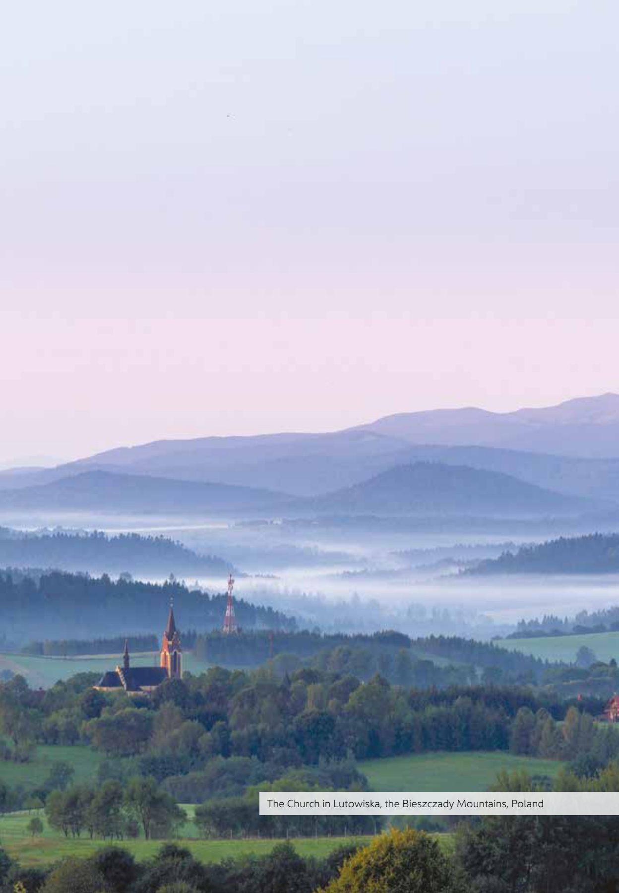
The Church in Lutowiska, the Bieszczady Mountains, Poland