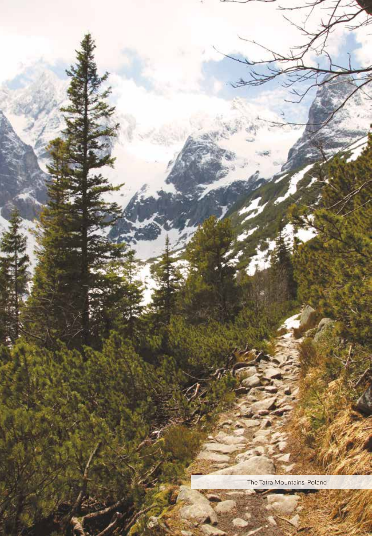
The Tatra Mountains, Poland