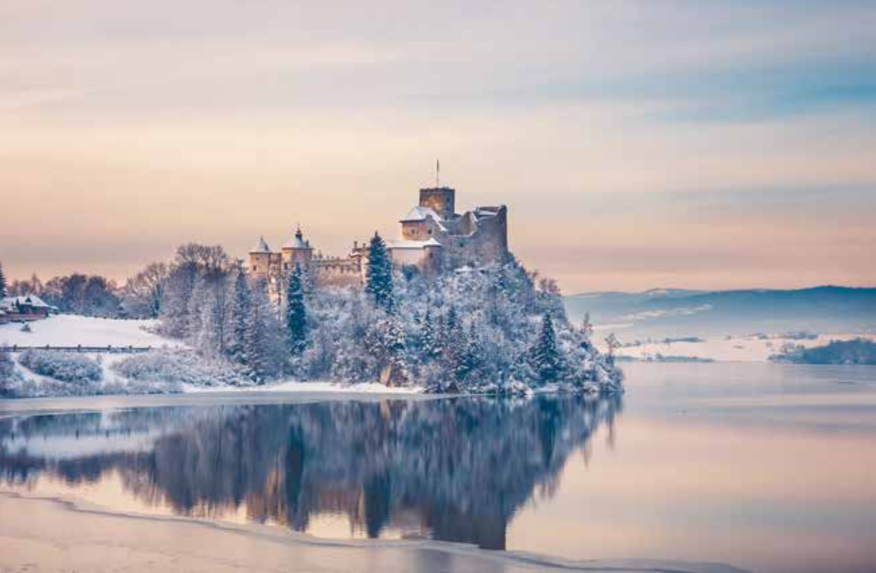
The Niedzica Castle, Poland

Europe's favour, and according to others, the hands of the clock have even started turning in the opposite direction.