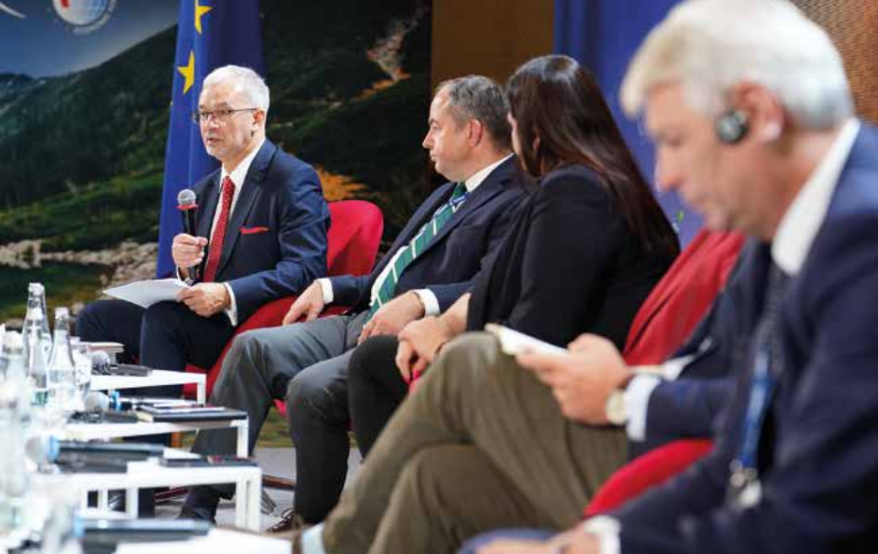
Participants in the panel A reconstruction plan for Europe. The National Recovery Plan. The Carpathian Strategy , Karpacz, 9 September 2021