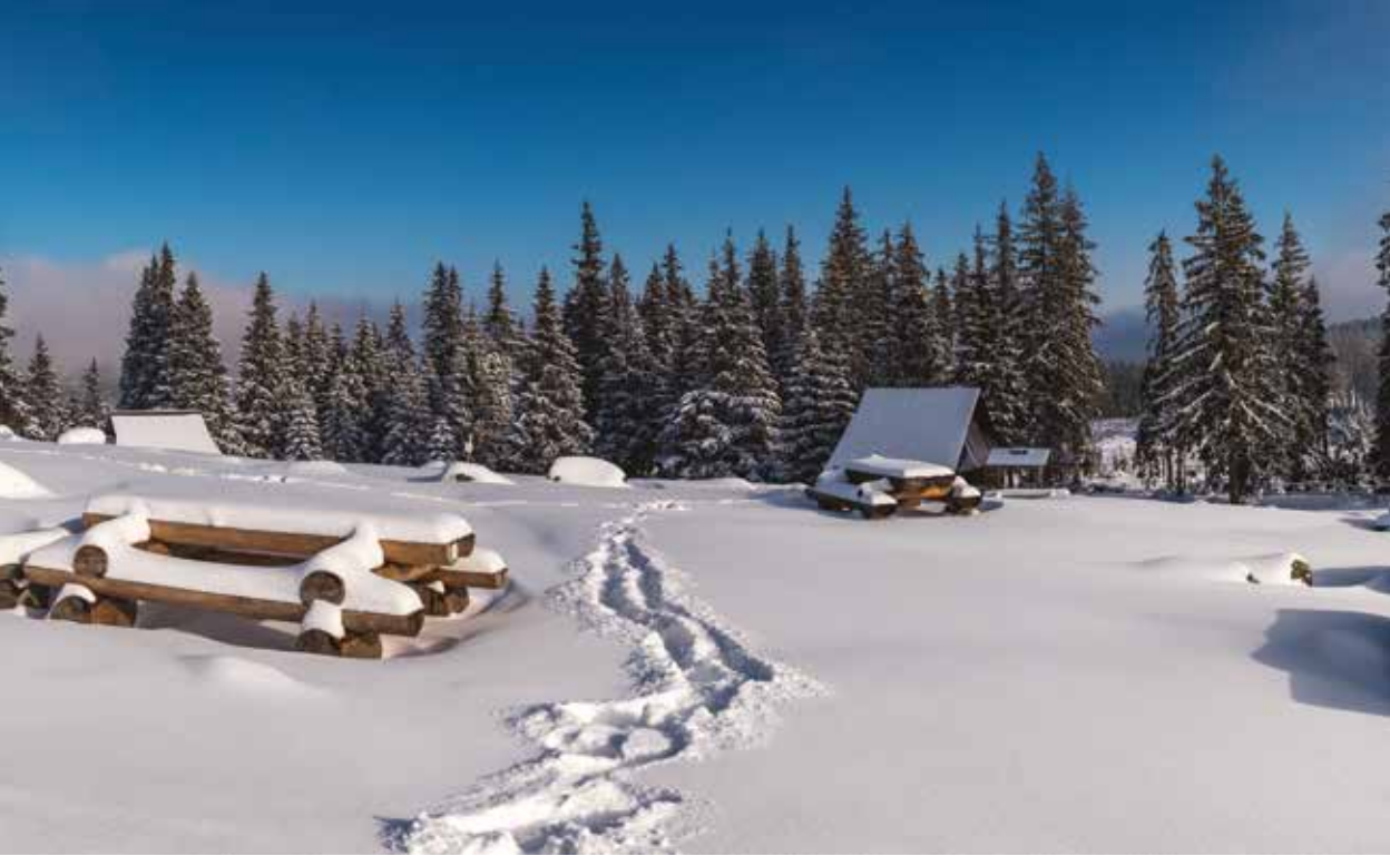
The Rusinowa Glade, the Carpathian Mountains, Poland

In conclusion, I would like to emphasise that the new opening and the new financial perspective should also bring a new perspective on European resources. The funds earmarked for the climate (which we, Poland, have reservations about) and digitisation (which is not controversial) should be treated not as a problem but as an opportunity for this budget because of our enormous needs in this area. If we do not meet them quickly, they will become even more remarkable. It will seriously impact the competitiveness of the economies of this part of Europe, which is doing very well today. However, we must not forget that the success of these economies is precisely due to the competitiveness that is under threat today, which has made it possible to reap huge profits from the Community market. If we do not quickly meet the digital and climate needs of our economies, we may lose our greatest asset and get stuck in a severe systemic problem.