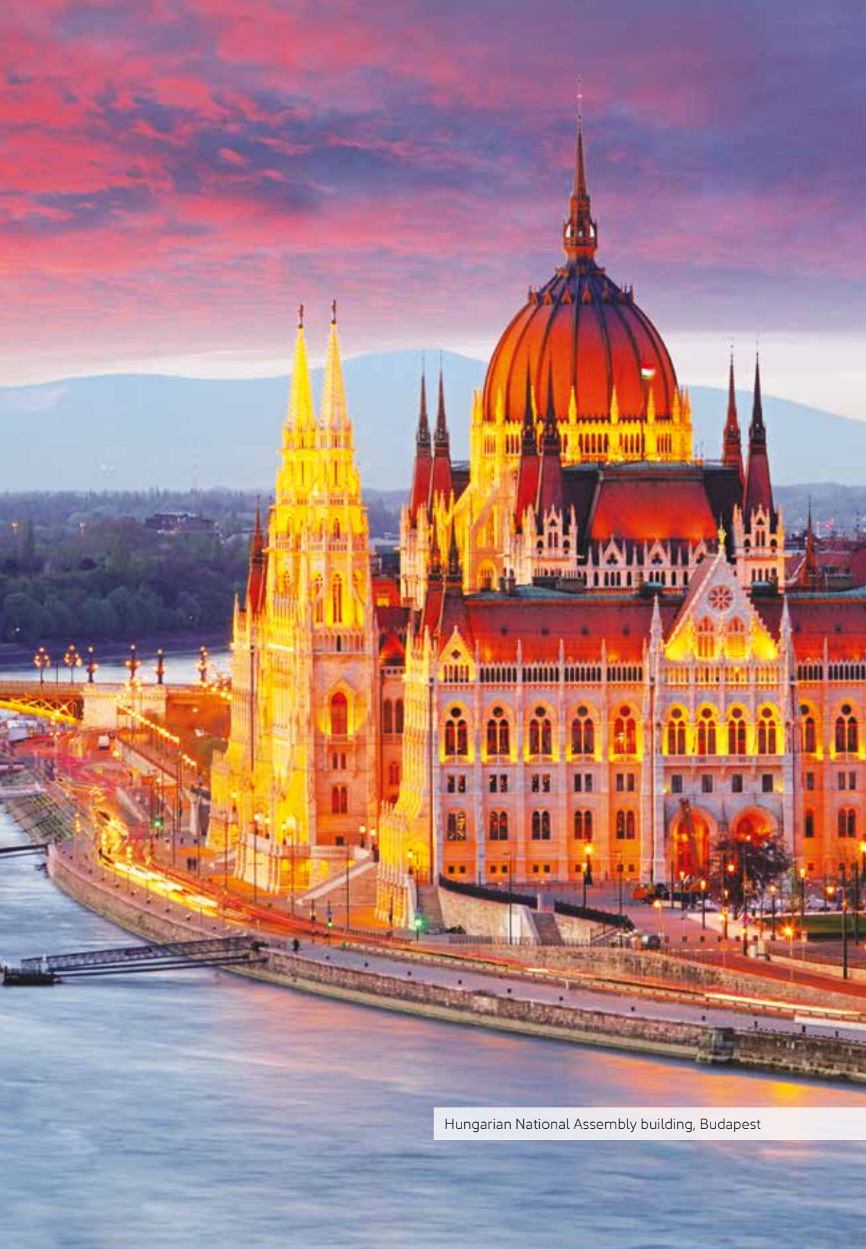
Hungarian National Assembly building, Budapest