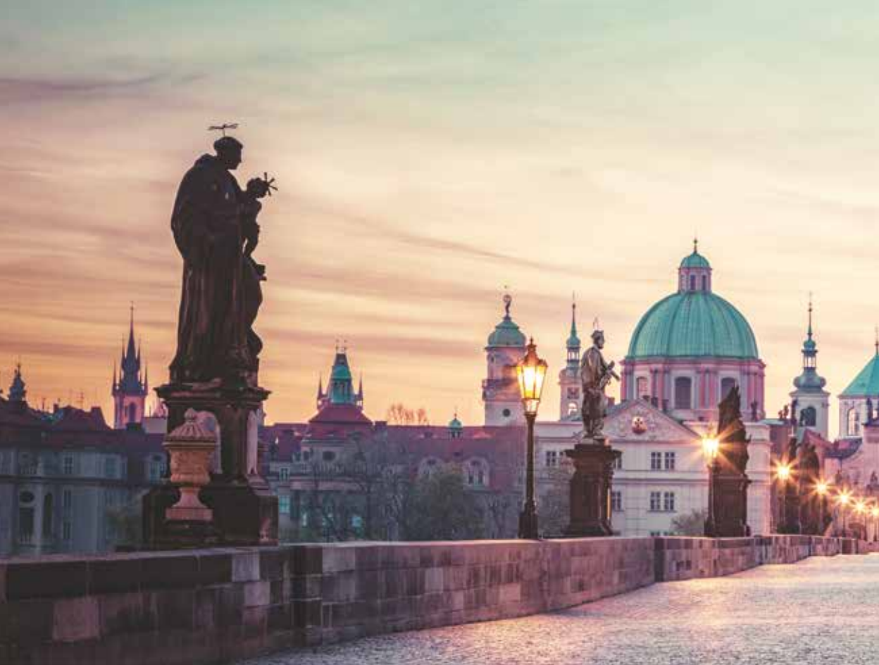
The Charles Bridge in Prague, the Czech Republic

how much we Western Europeans do not understand what is happening in Hungary and Poland and judge by pointing the finger at democratically elected governments. If we do not assume that central and eastern Europe was ruled by a communist dictatorship until a few decades ago, we will never be able to understand what is happening there.