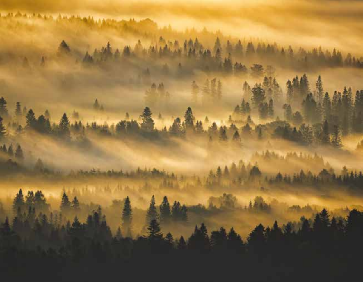
The Bieszczady Mountains, Poland

view. He stated that ideas and imagination were the most important, as they helped people to influence the reality.