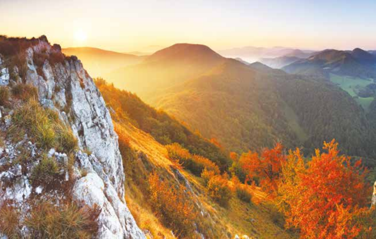
The Carpathians, Slovakia

The Commission is to propose new sources of revenue by 2024, including: