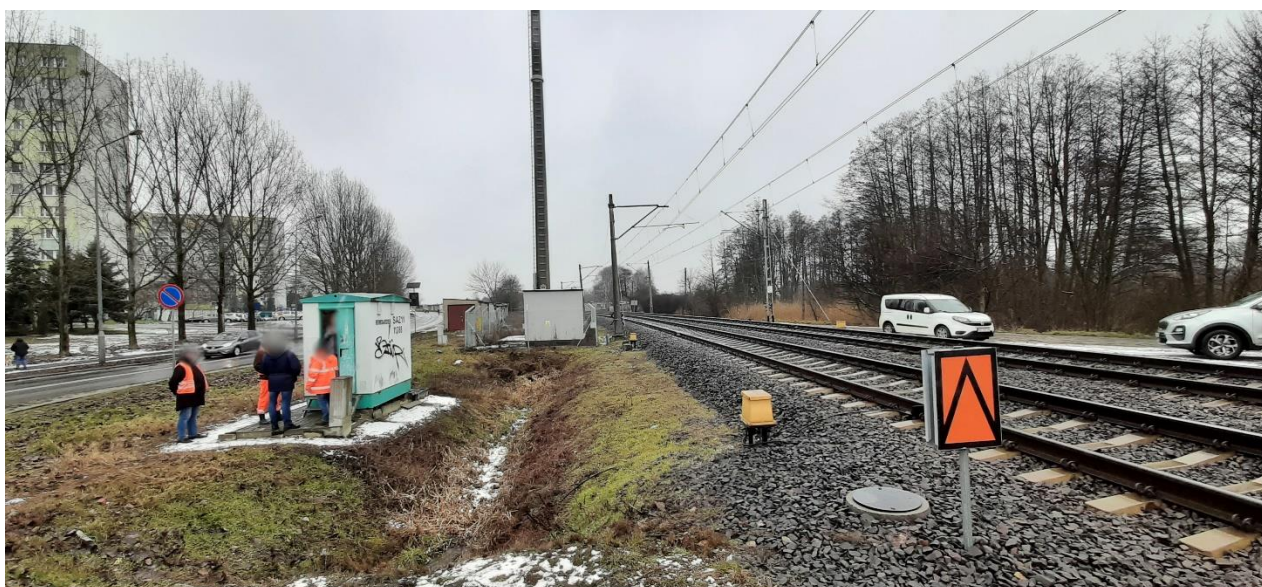
Photograph 6 – A view of track no. 2 from the road from the distance of 5 metres from the outermost rail

The level crossing at Nad Różanym Potokiem street is located behind an elevation relative to Stróżyńskiego street. The approach to the crossing from Stróżyńskiego street is inclined by 4.195% along the length of 17.5 metres. At the point of measurement of the visibility triangle from 5 metres, looking to the left (from the direction of a moving car), there is a container with a GSM-R mast. The structure obscures visibility of trains incoming from the left for drivers of road vehicles. The structure also obstructs visibility for drivers of trains during observation of the approach leading to the level crossing. Photographs 6 and 7 show visibility from the road onto track no. 2 from 5 metres, and from track no. 2 onto the approach and level crossing at km 11.788 from around 80 metres before the level crossing.