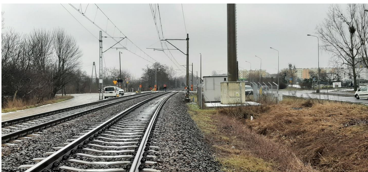
Photograph 7 – A view from track no. 2 on the access road and the level crossing at km.11.788 from the distance of around 80 metres