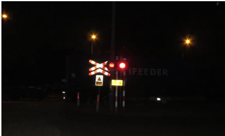
Photograph 3 – Signage of the level crossing immediately after the accident

Due to the malfunction of the Automatic Crossing System (SSP), boards reading "Signalling out of order" were put on the signals. In the event of unserviceability of SSP devices, the infrastructure manager is required to mark the level crossing concerned with the sign B-20 "STOP". The sign was not there at the moment of the accident (Photograph 3).