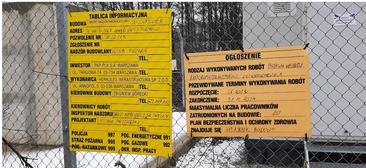
Photograph 8 – Boards placed on the fence of the construction work

Erecting the GSM-R container and mast within the visibility triangle at 5 m significantly reduced visibility for road users, making it more difficult to notice a train incoming on track no. 2, and also leaves the train driver with very little reaction time if he notices any irregularities in the behaviour of road vehicle drivers. A road vehicle that stopped before the level crossing is practically invisible for the train driver from the distance of around 80 metres before the level crossing. In accordance with the provisions of Paragraph 15, Part B, Annex 3 to the Regulation of the Minister of Infrastructure and Development of 20 October 2015 on the technical conditions to be met by crossings of railway lines and sidings with roads, and on their positioning (Journal of Laws of 2015, items 1744, as amended), "Within the boundaries of visibility triangles, no objects that reduce visibility shall be placed, in particular construction works, trees, shrubs and other high-growing plants, advertisements, elements of acoustic protection". The erection of the construction works in the 5 m visibility triangle started in 2019. PKP PLK S.A. is the investor. Photograph 8 shows boards placed on the object.