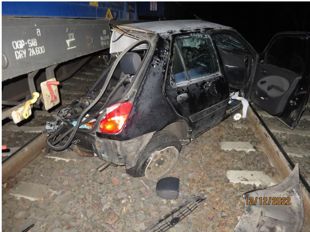
Photograph 1 – Outcomes of the occurrence