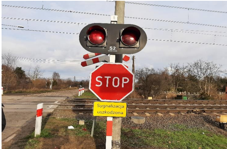
Photograph 4 – Signage of the level crossing after the arrival of PKBWK representatives

The sign B-20 "STOP" was placed in the morning of 12 December 2022.