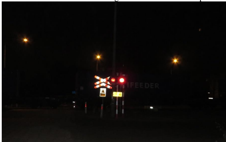
Photograph 2 – A view of level crossing signalling immediately after the accident.

No works were conducted in the level crossing area that could have impact on causing the occurrence.