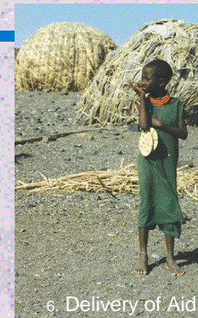
6. Delivery of Aid