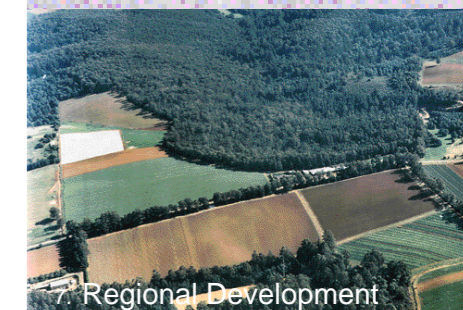
7. Regional Development