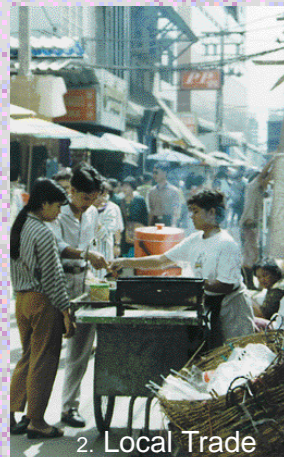
2. Local Trade