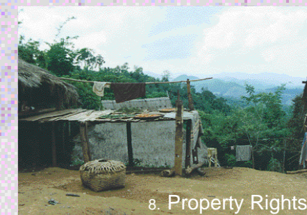
8. Property Rights