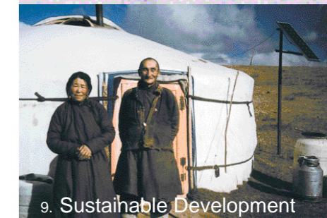
9. Sustainable Development