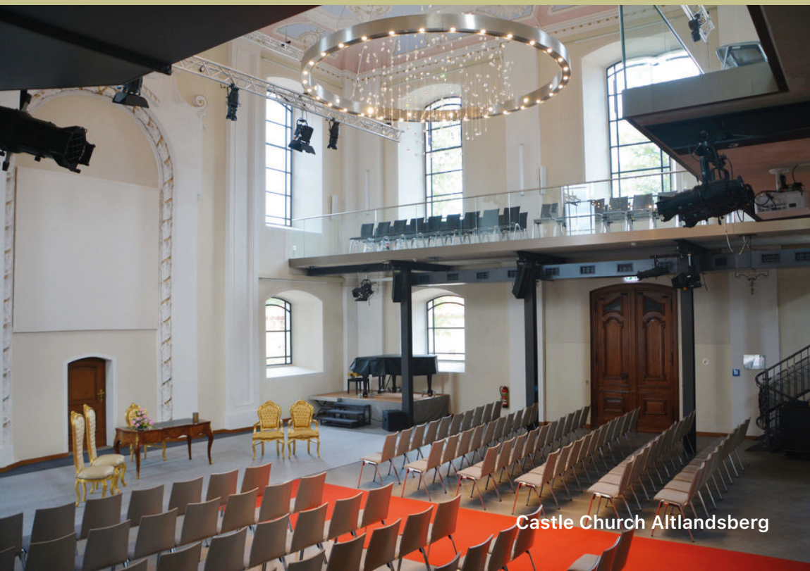
Castle Church Altlandsberg