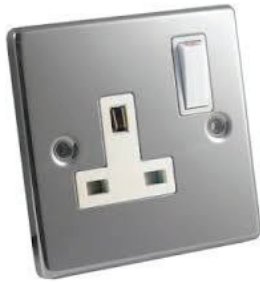
ES 3-PIN ELECTRICAL SOCKET