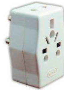
MPA MULTI-PIN PLUG ADAPTOR