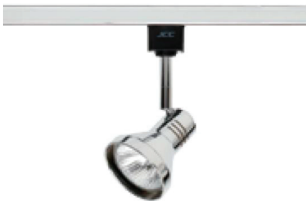
SL SPOT LIGHT ON TRACK