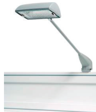
ASL ARM SPOTLIGHT