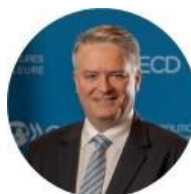
Mr. Matthias Cormann, Secretary-General of the OECD