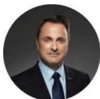
Mr. Xavier Bettel, Prime Minister of Luxembourg