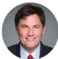
Mr. Dominic LeBlanc, Minister of Intergovernmental Affairs, Infrastructure and Communities, Canada