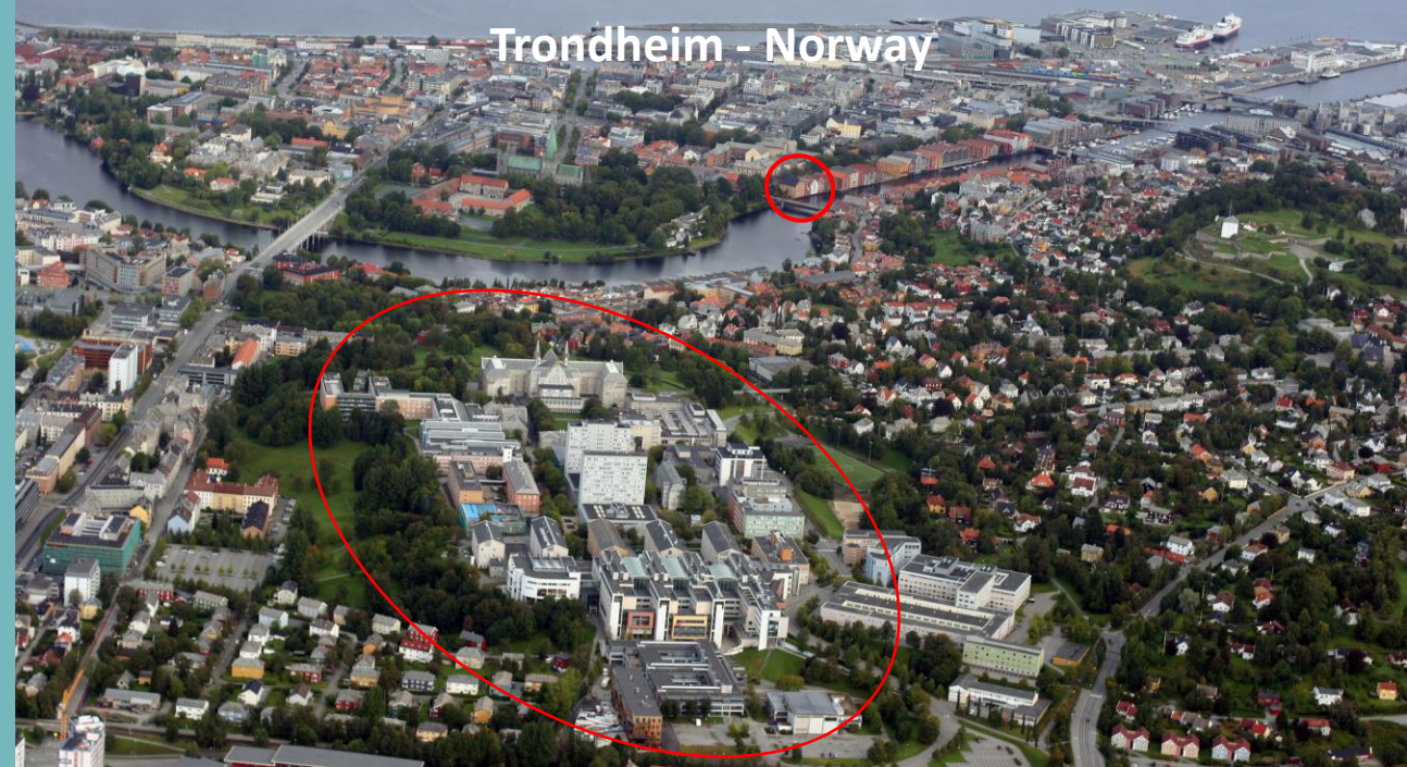
Trondheim - Norway