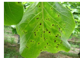
Bacterial canker of kiwifruit ( Pseudomonas syringae pv. actinidae ): invisible ... but it can destroy our kiwifruit orchards.