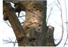
Asian longhorned beetle ( Anoplophora glabripennis ): beautiful ... but it can kill our valuable trees.