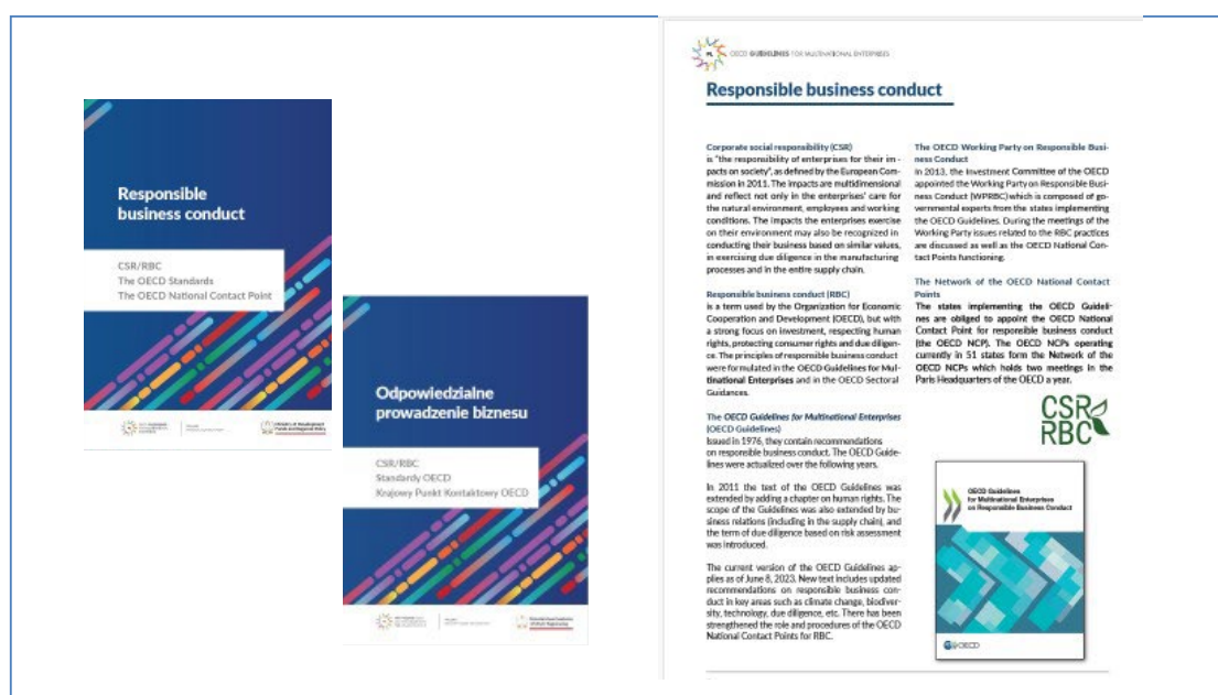
Figure 4.1. Cover page and content of the Polish NCP's information booklet