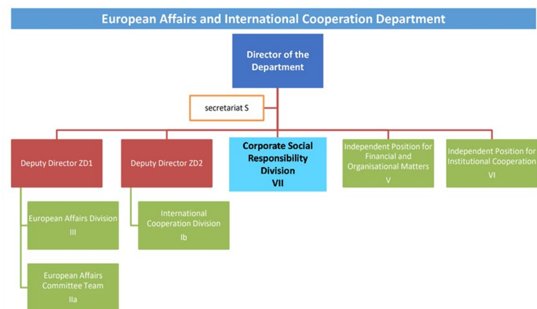
Figure 3.1. Location of the Corporate Social Responsibility Division since April 2023