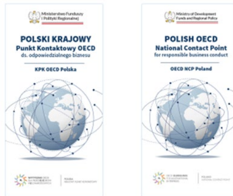
Figure 4.2. Banner of the Polish NCP

The NCP is very active at national and regional level in organising and participating in events. The NCP organised and co-organised three to 11 events per year since 2016 (see Annex C Promotional Events), with an average of 5.4 events per year. From 2016 to 2022, the NCP organised 88, which were attended by approximately 10 thousand participants. The NCP was particularly active in 2017 with 32 events (both organised or co-organised by the NCP and participated in) attended by 2 670 participants. In 2021 and 2020, the NCP managed to maintain its promotional efforts despite the Covid-19 pandemic through in person meetings and webinars with strong participation, including 3 500 participants online. The NCP currently uses a banner in promotional events as part of its visual identity (see Figure 4.2).