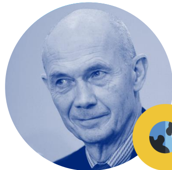
Pascal Lamy Healthy Oceans, Seas, Coastal and inland Waters