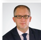
Mr. Łukasz Borowiak Mayor of Leszno