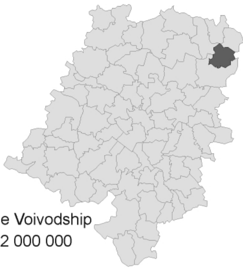
Opole Voivodship 1:2 000 000