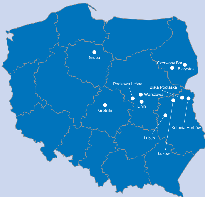
Map 1. Localization of centers for foreigners who submitted the application to be granted refugee status in Poland